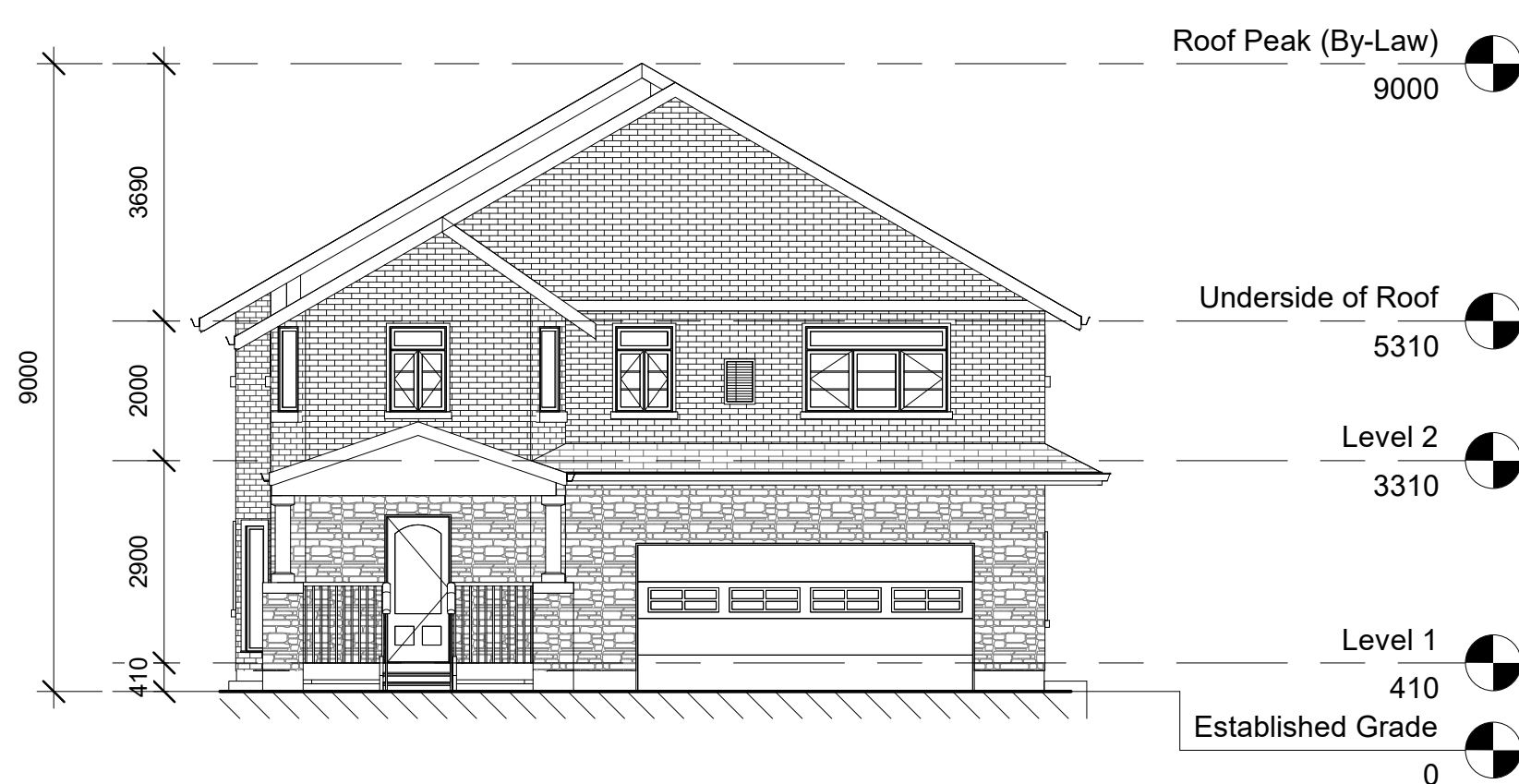
3 East Elevation 1 : 100