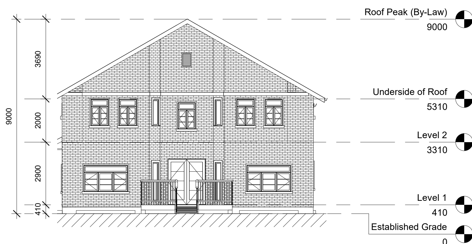
4 West Elevation 1 : 100