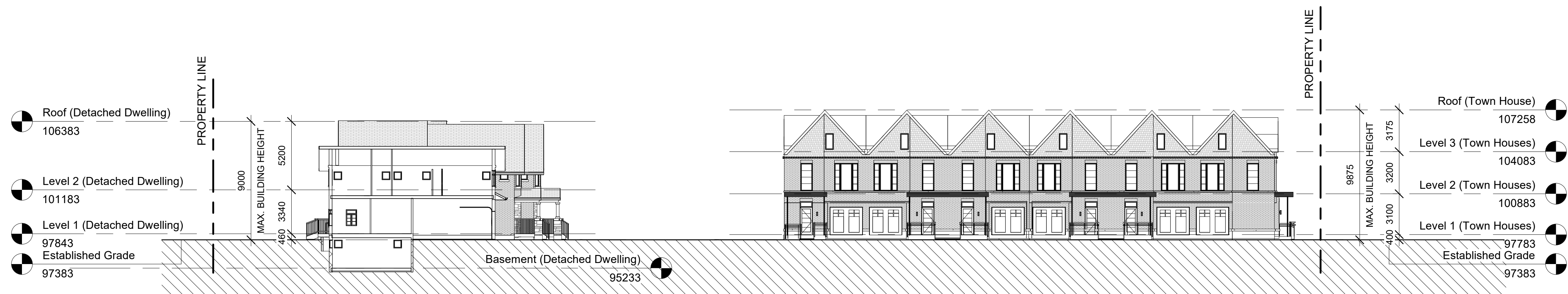
2 South Elevation 1 : 200