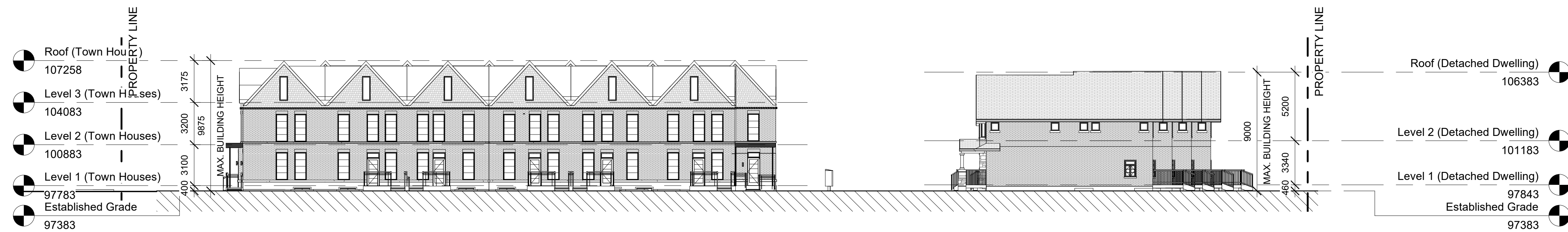
1 North Elevation 1 : 200