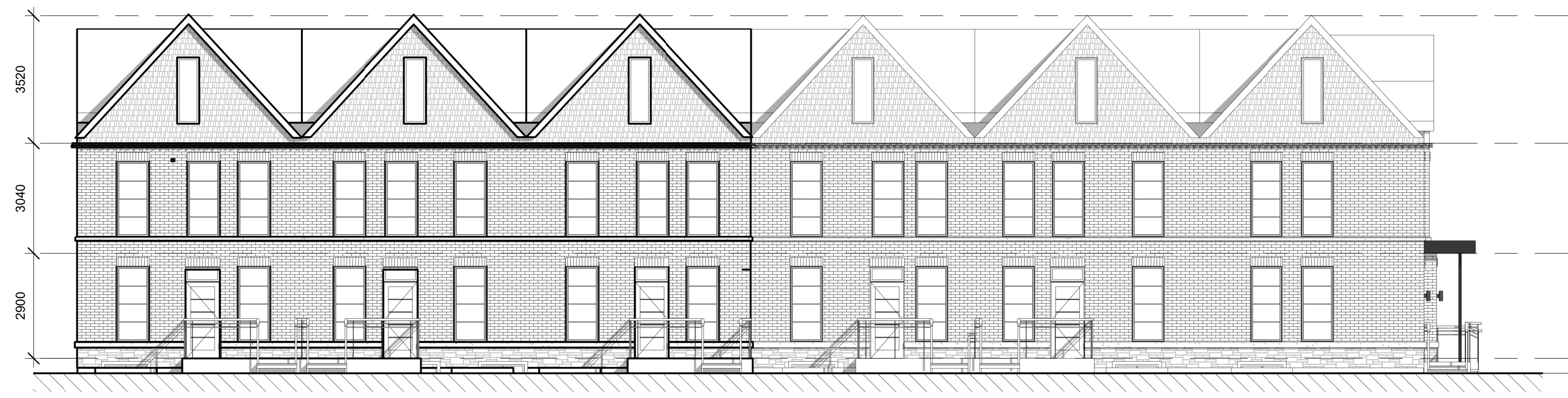
2 BUILDING B SOUTH ELEVATION 1 : 100