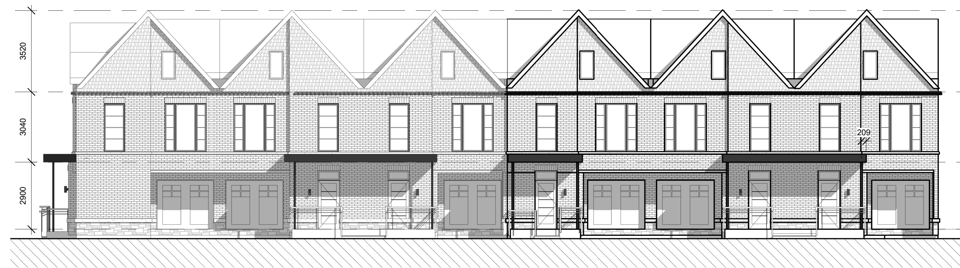
1 BUILDING B NORTH ELEVATION 1 : 100