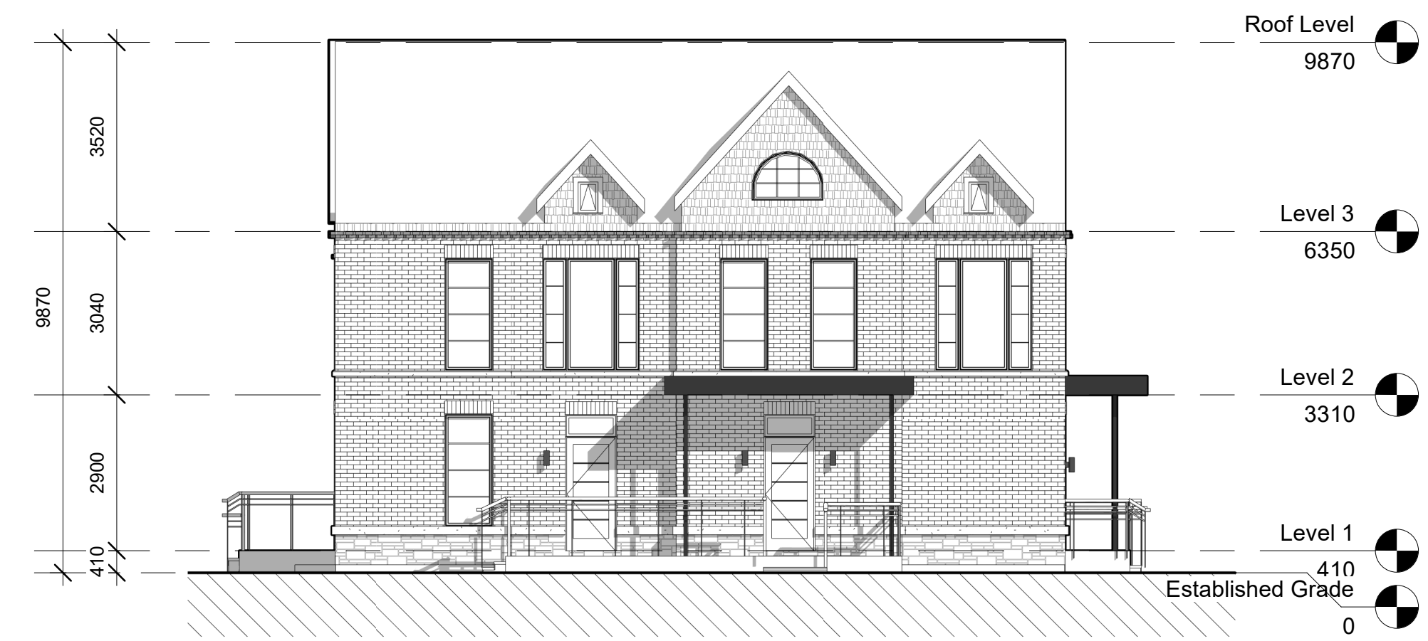
3 BUILDING B EAST ELEVATION 1 : 100