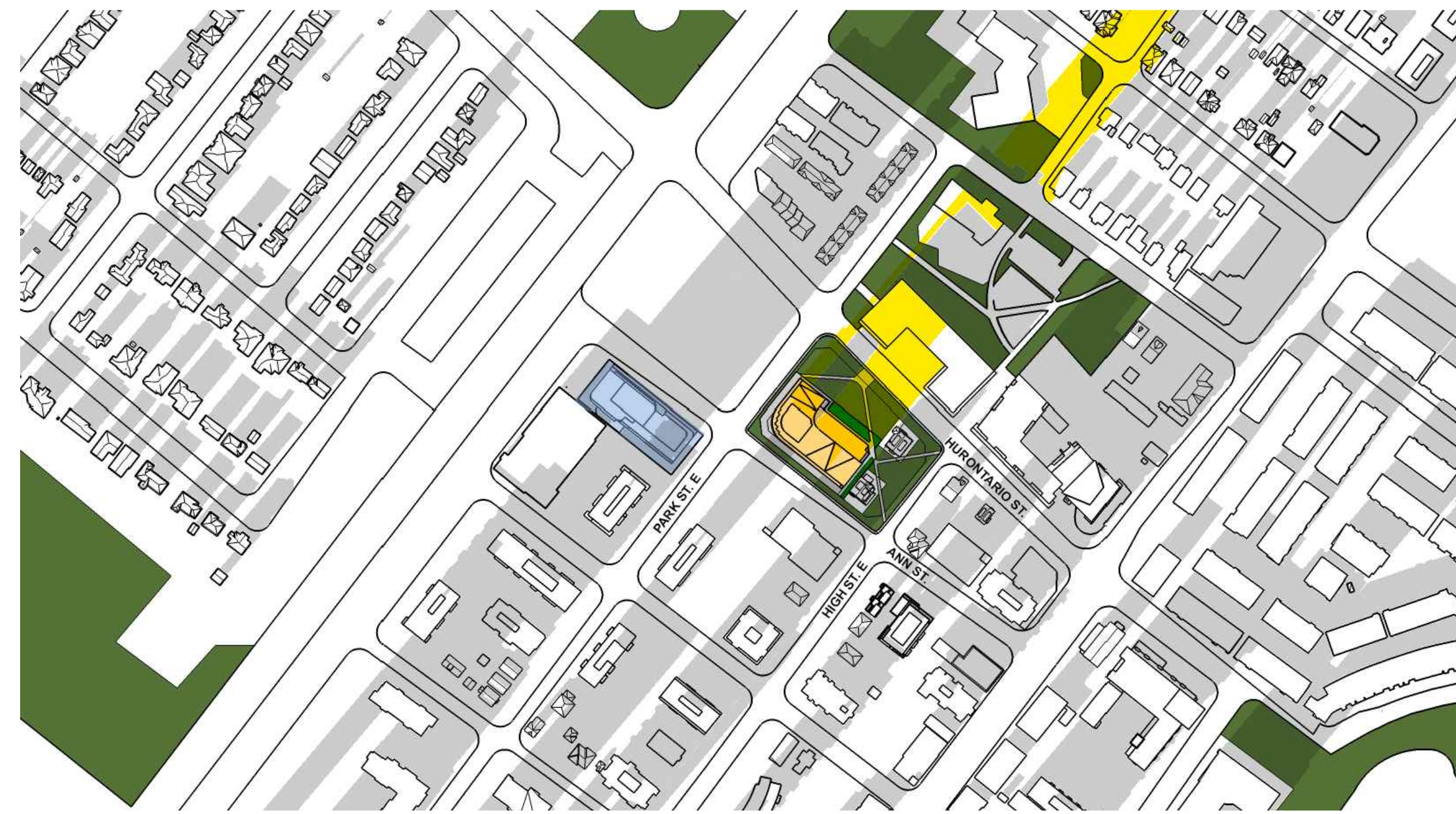
21 DECEMBER, 15:15