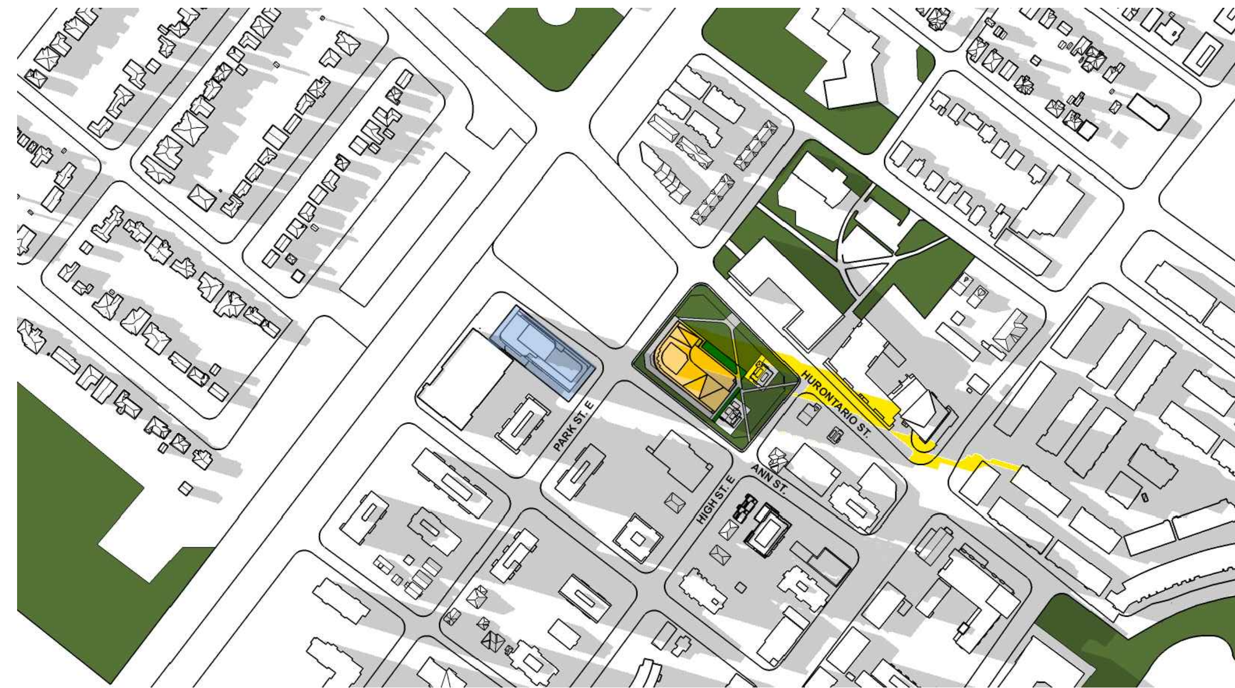
21 JUNE, 18:20