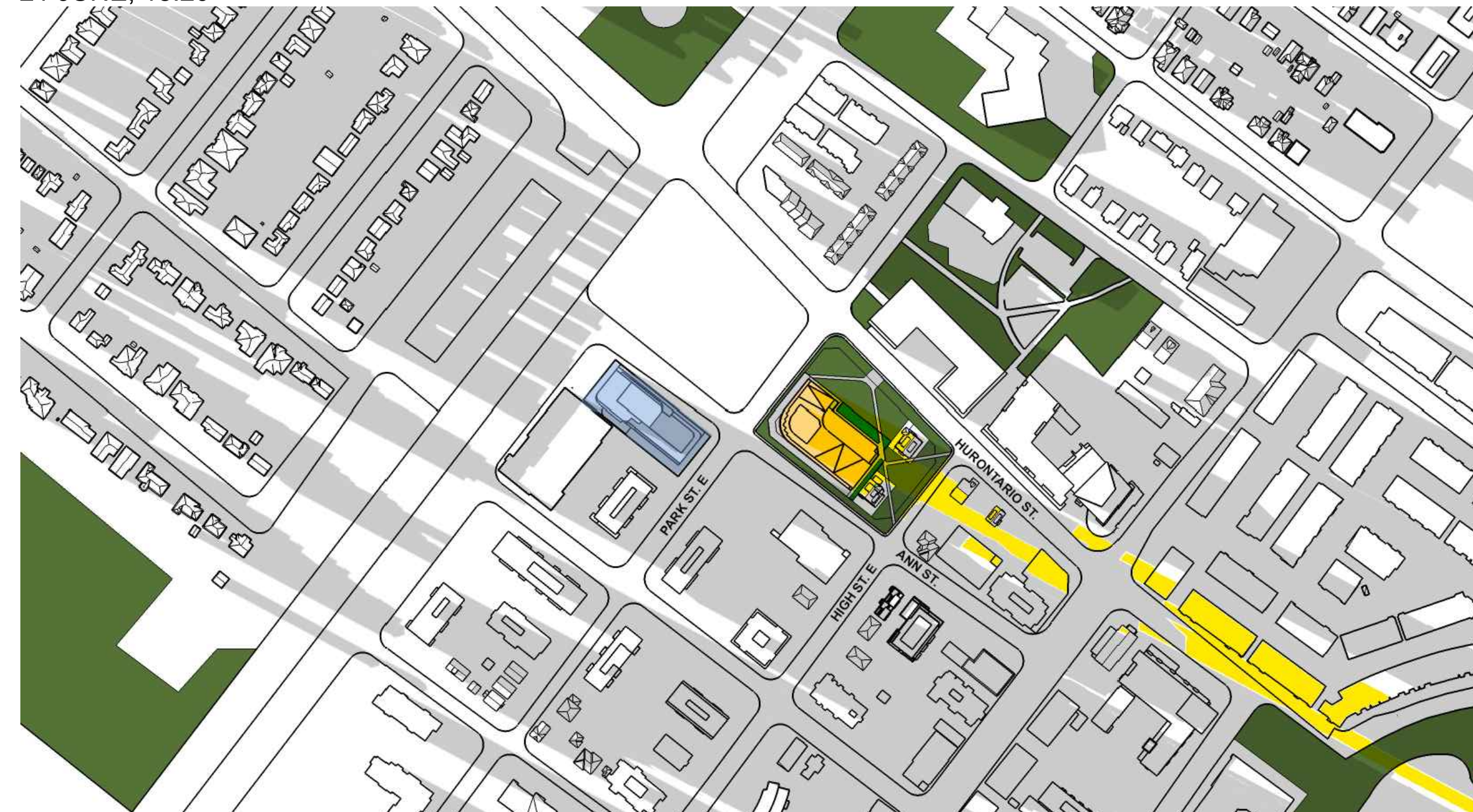
21 JUNE, 19:33