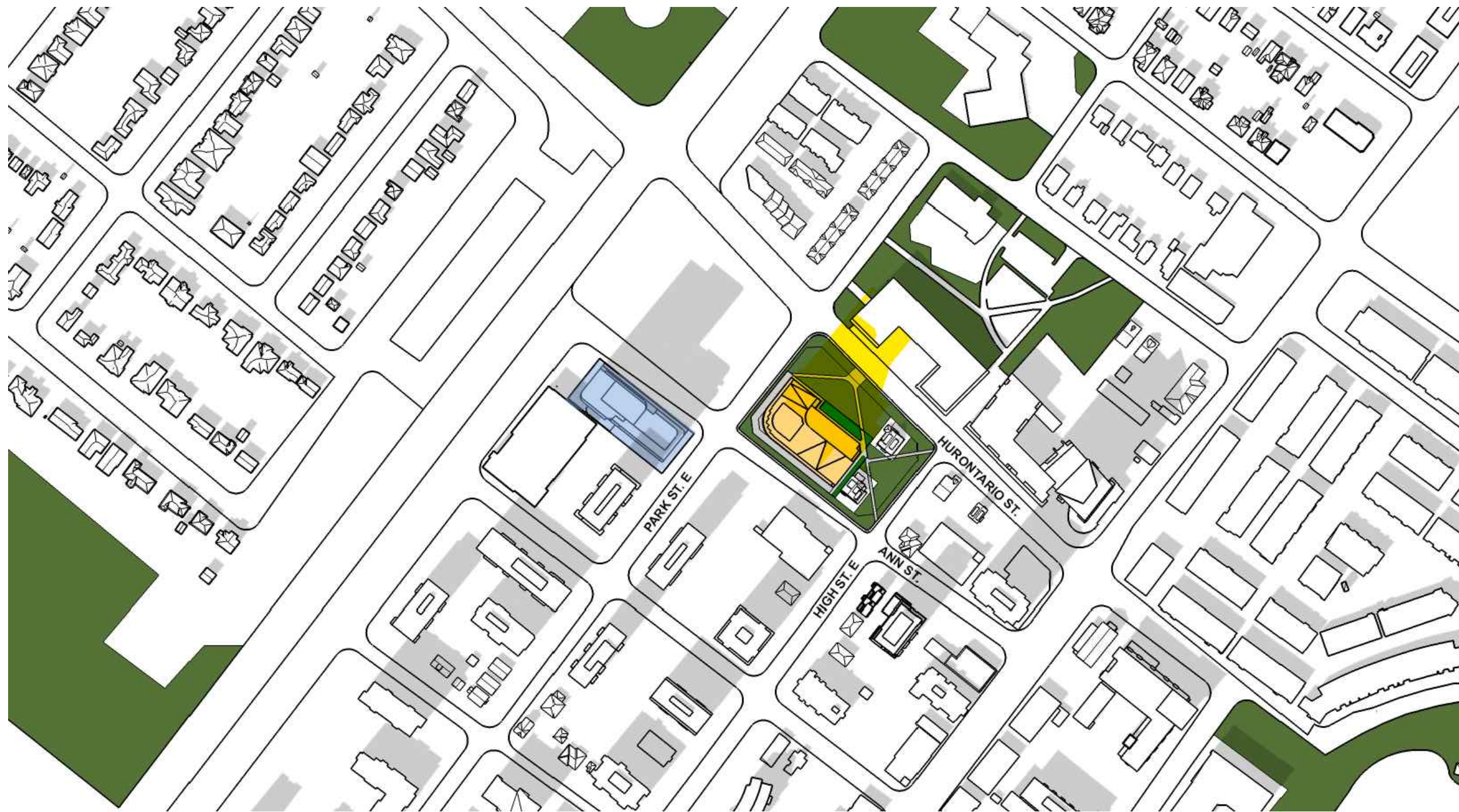
21 MARCH/SEPTEMBER, 14:12