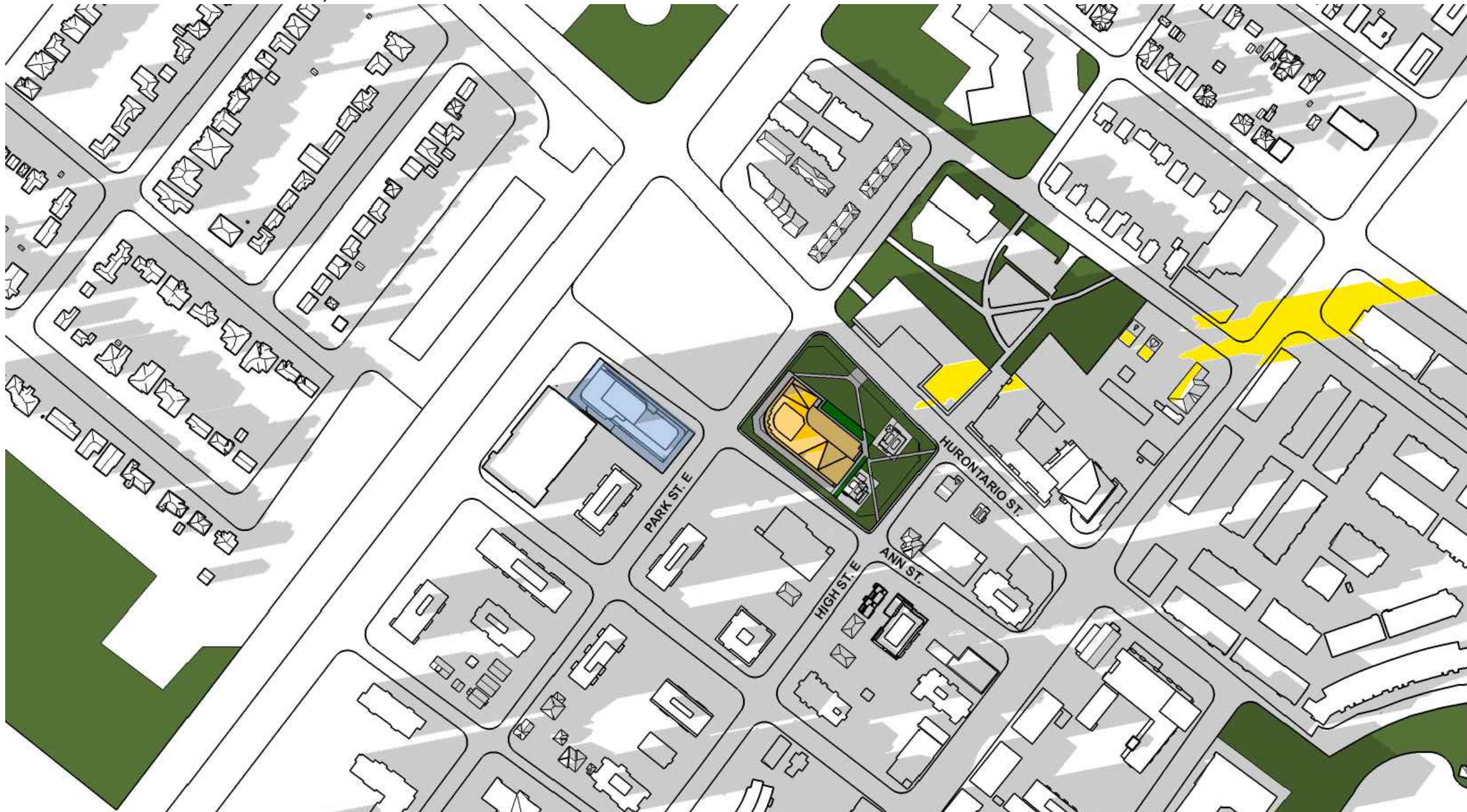
21 MARCH/SEPTEMBER, 17:12