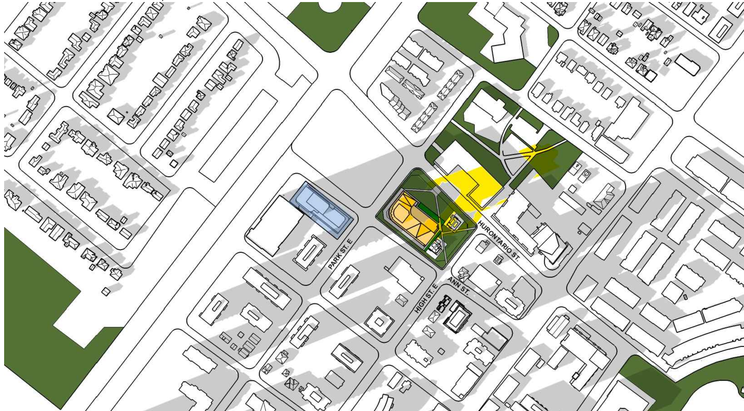
21 MARCH/SEPTEMBER, 16:12