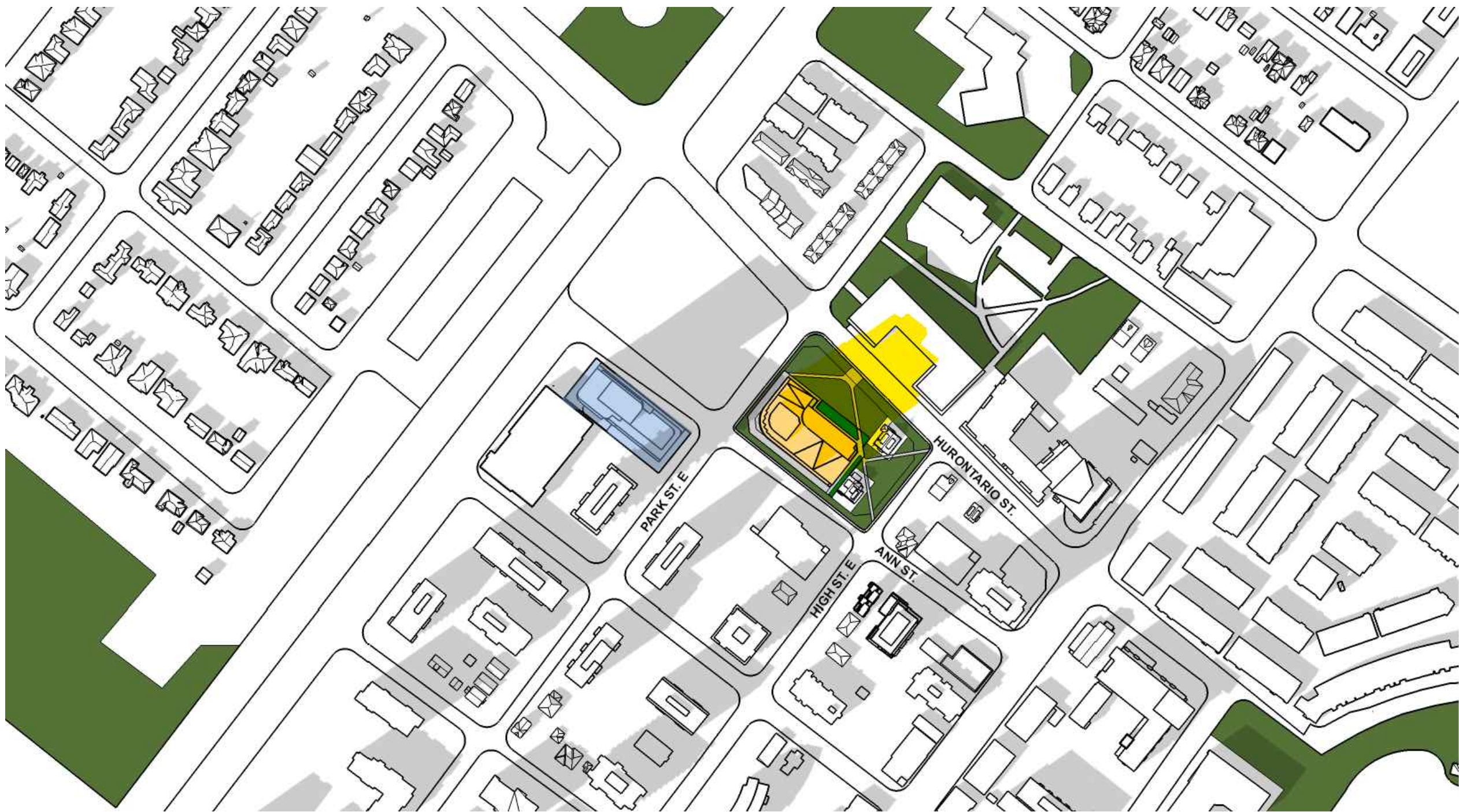
21 MARCH/SEPTEMBER, 15:12