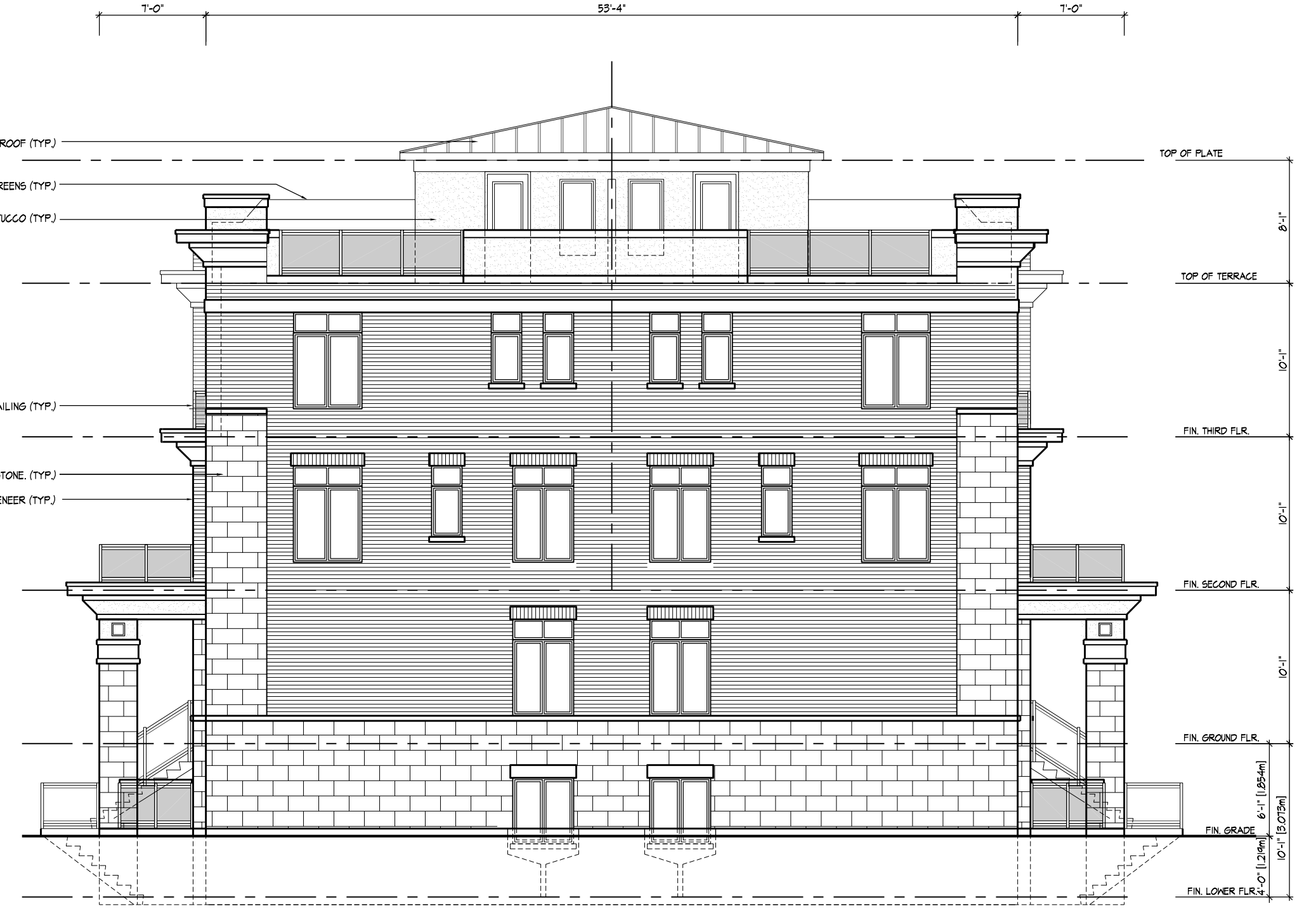
WEST ELEVATION TOWNHOUSE TYPE '2B' - BLOCK 7