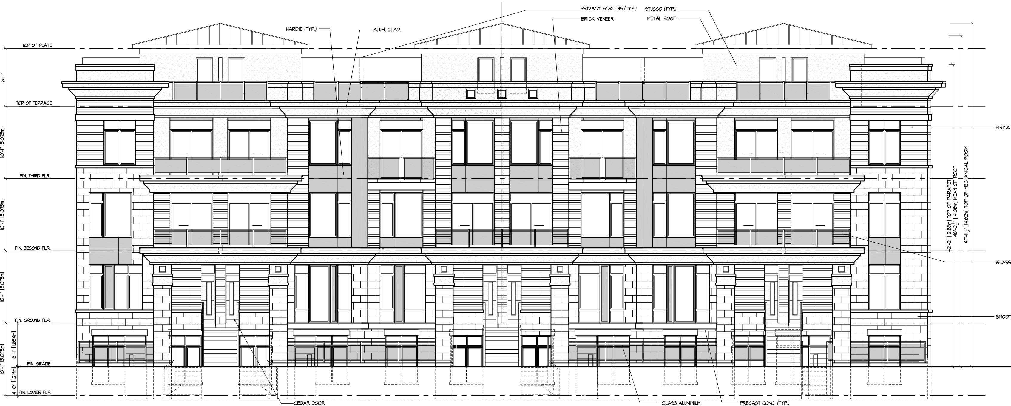
NORTH ELEVATION TOWNHOUSE TYPE '2B' - BLOCK 7

DATE: 11/08/2021 PROJECT: 218072 - TOWNHOUSE TYPE '2B' - BLOCK 7