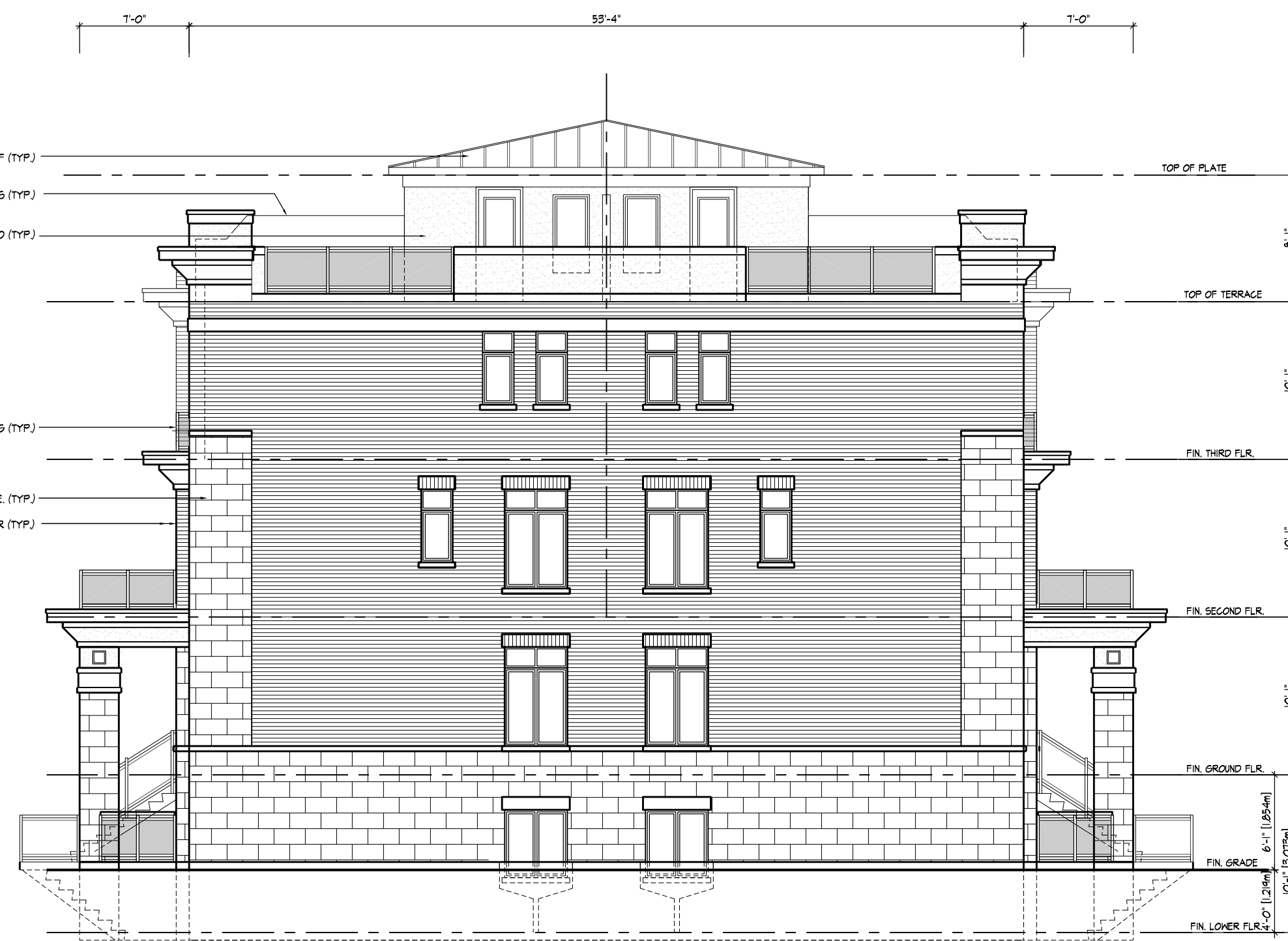
EAST ELEVATION TOWNHOUSE TYPE '1' - BLOCKS 5,6