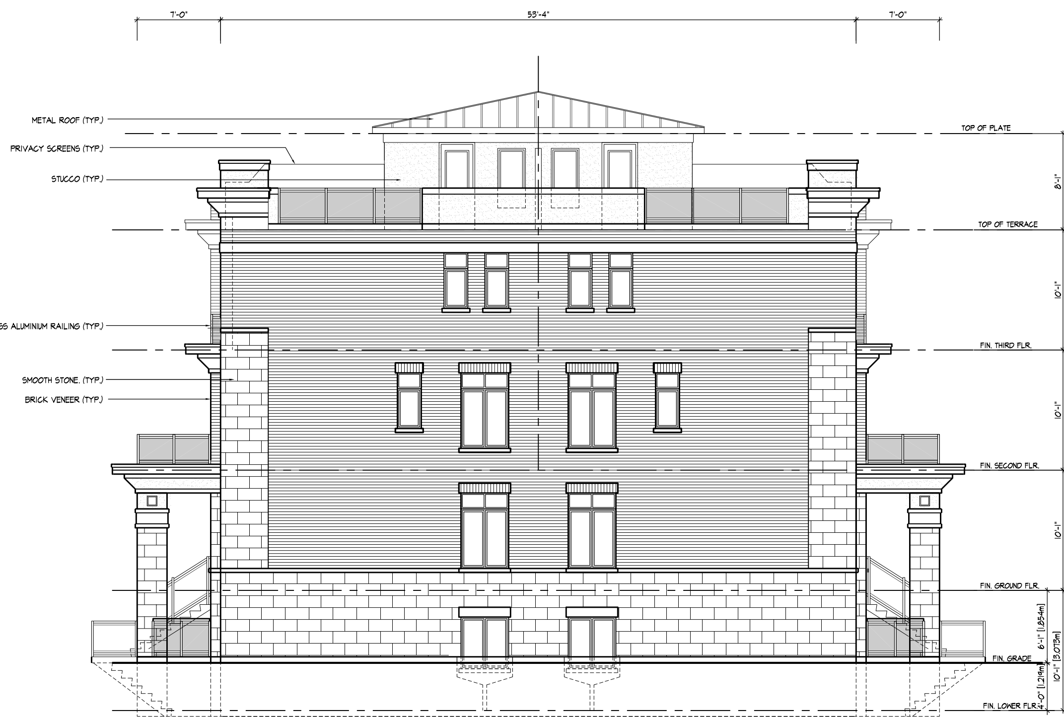
WEST SIDE ELEVATION TOWNHOUSE TYPE '1' - BLOCKS 5,6