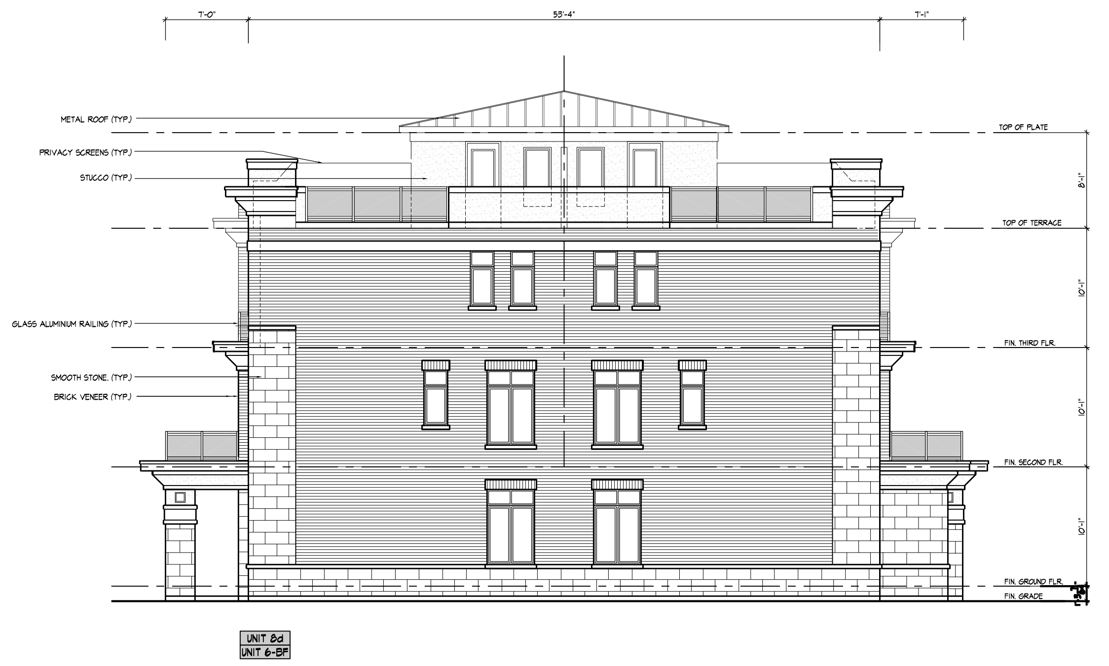
EAST ELEVATION TOWNHOUSE TYPE '4' - BLOCK 2