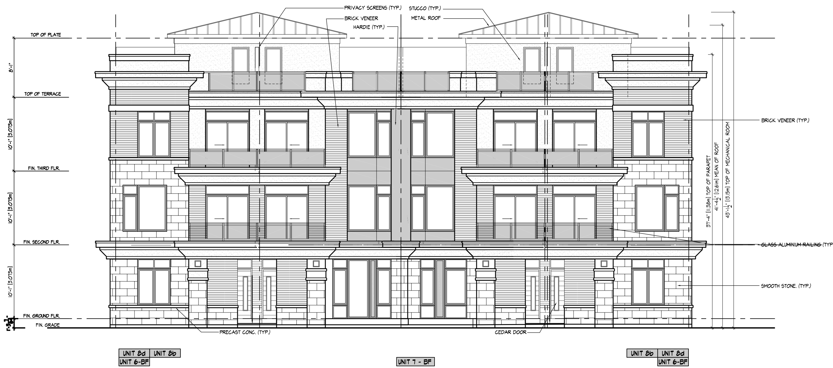
NORTH ELEVATION TOWNHOUSE TYPE '4' - BLOCK 2