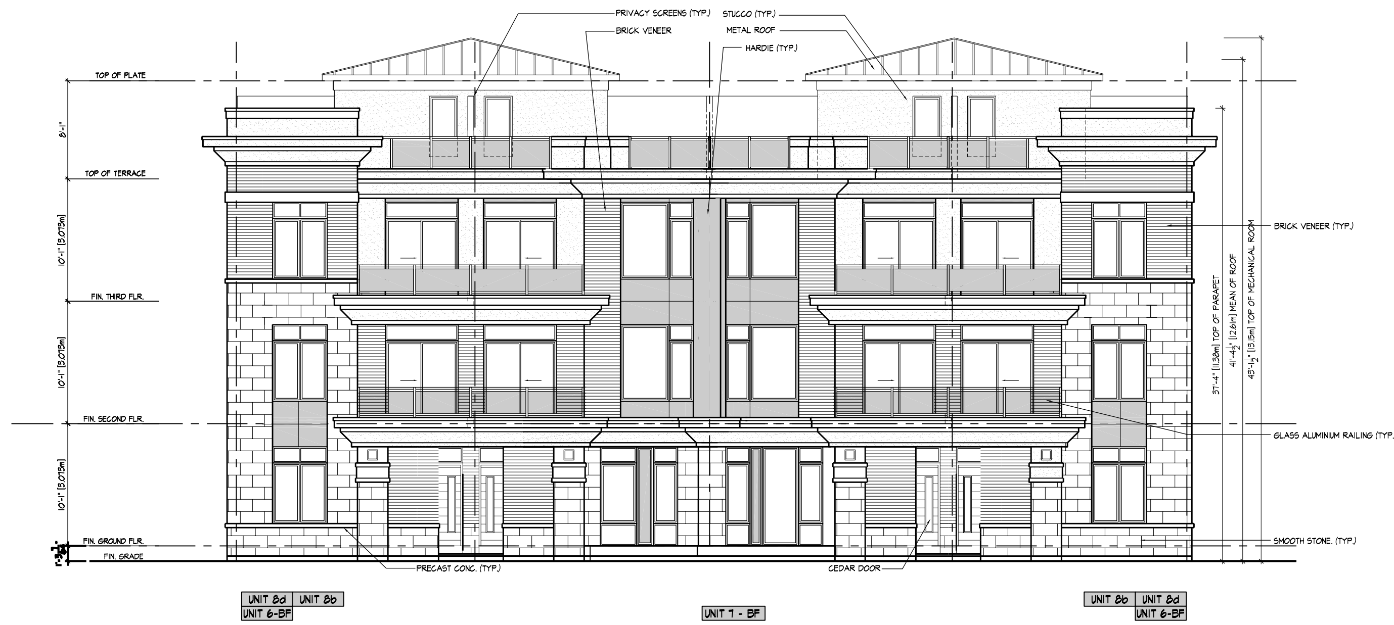
SOUTH ELEVATION TOWNHOUSE TYPE '4' - BLOCK 2

DATE: 11/08/2021 PROJECT: 218072 TOWNHOUSE RESIDENTIAL DEVELOPMENT - TYPE 4 - BLOCK 2