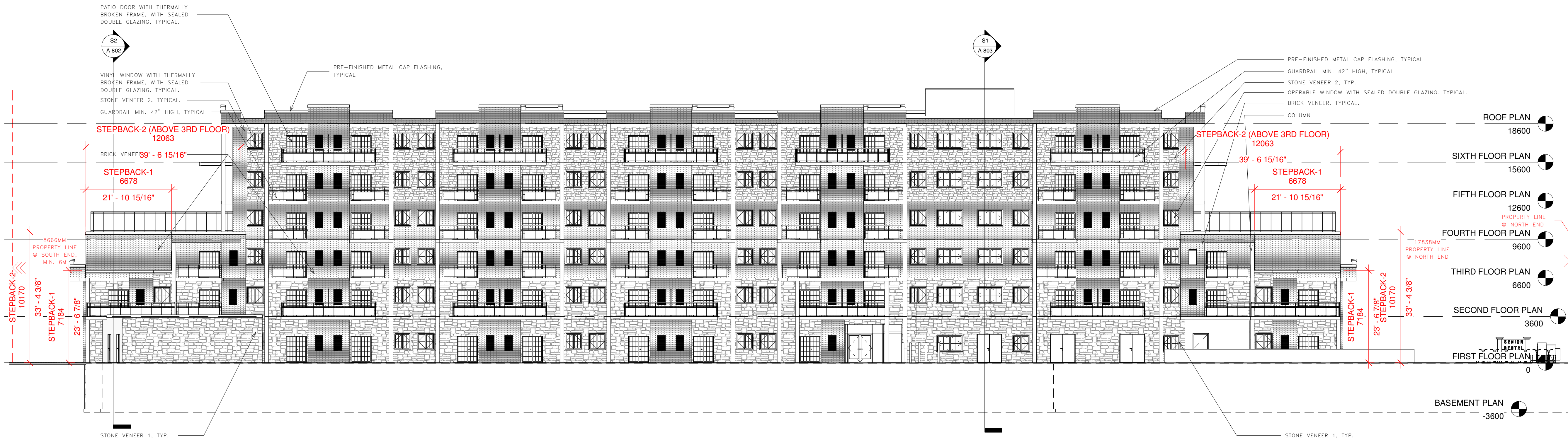
3 EAST ELEVATION