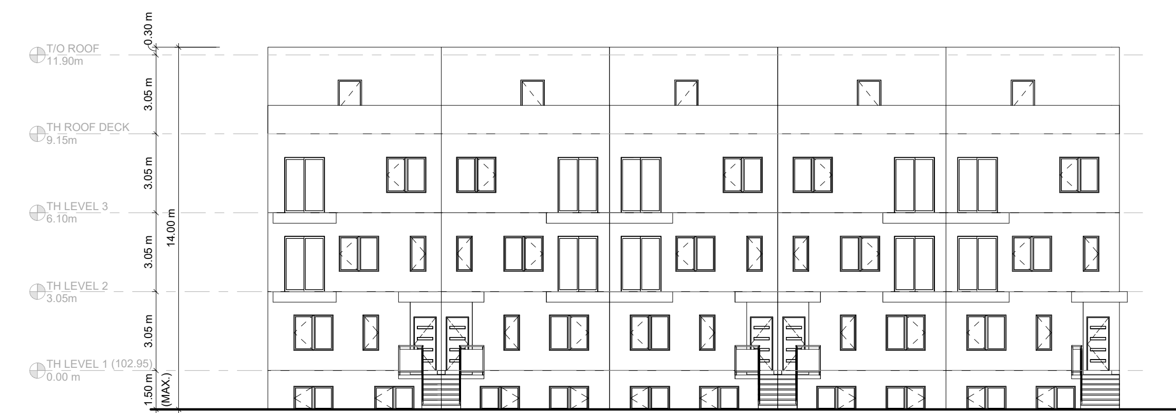
② STACKED TH - NORTH ELEVATION 1 : 150