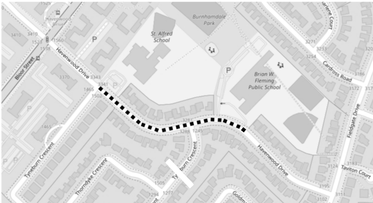
■■■■■■■■ Road Closure Area (No Through Traffic)

The pilot project will launch on Monday May 16 and will run Monday to Friday until Friday June 3 (3 weeks) . At the end of each school day (i.e. from 2:30 p.m. to 3:40 p.m.), Havenwood Drive will be temporarily closed to vehicle traffic . The planned area for the temporary road closure on Havenwood Drive is shown below: