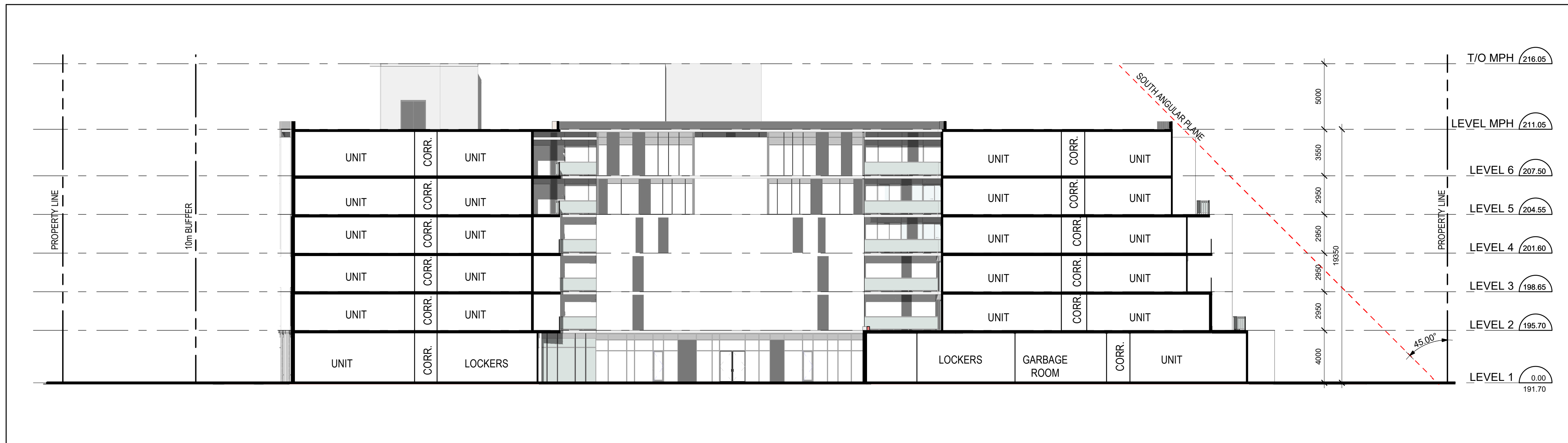
West elevation View 2 1 : 200 A401