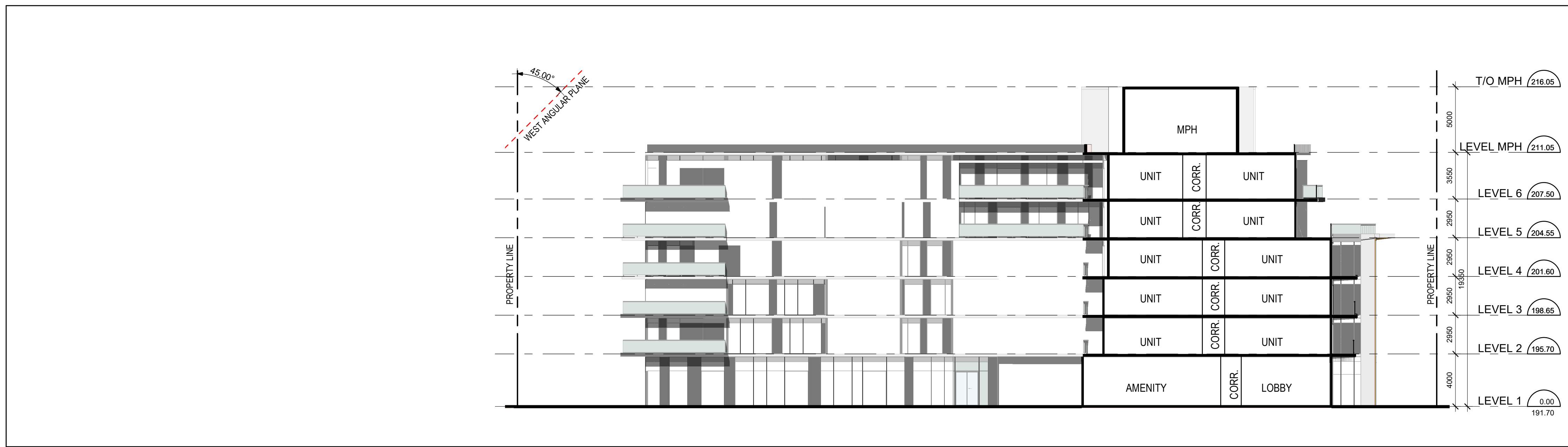
South Courtyard Elevation 3 1 : 200 A401