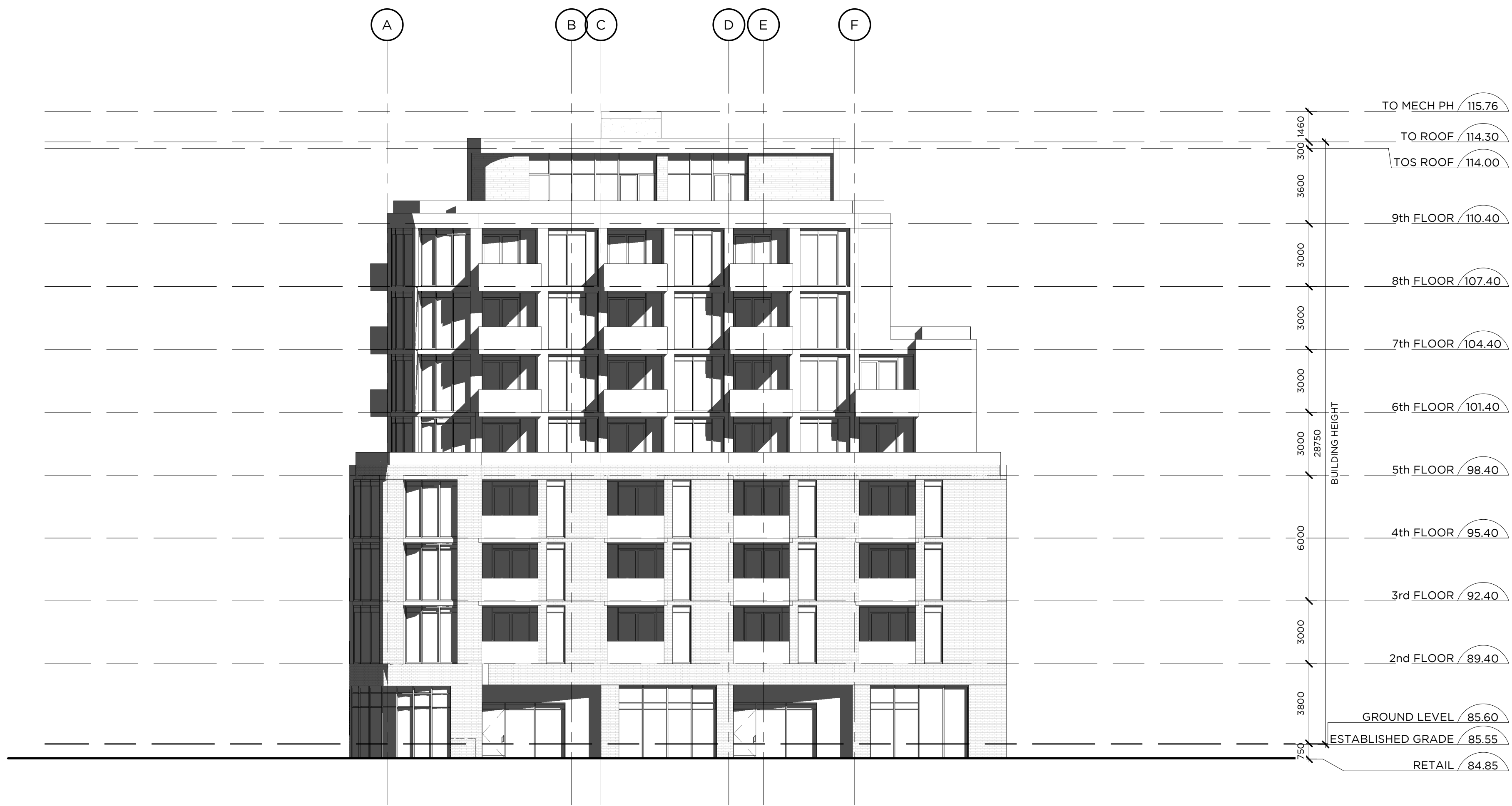
1 SOUTH EAST ELEVATION A401/1:150