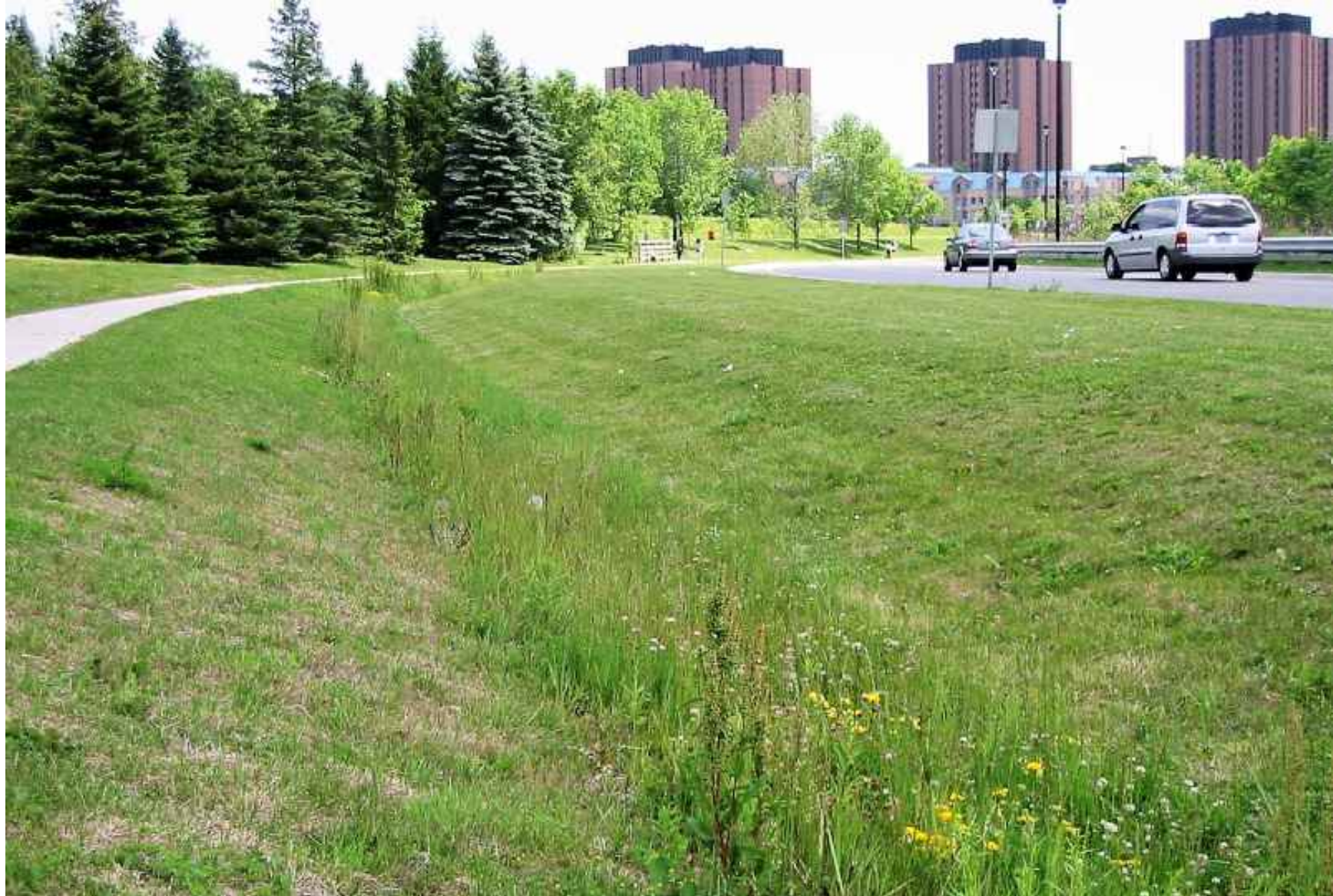
STORMWATER MANAGEMENT BIOSWALE / INFILTRATION GALLERY Image by Sustainable Technologies, 2019