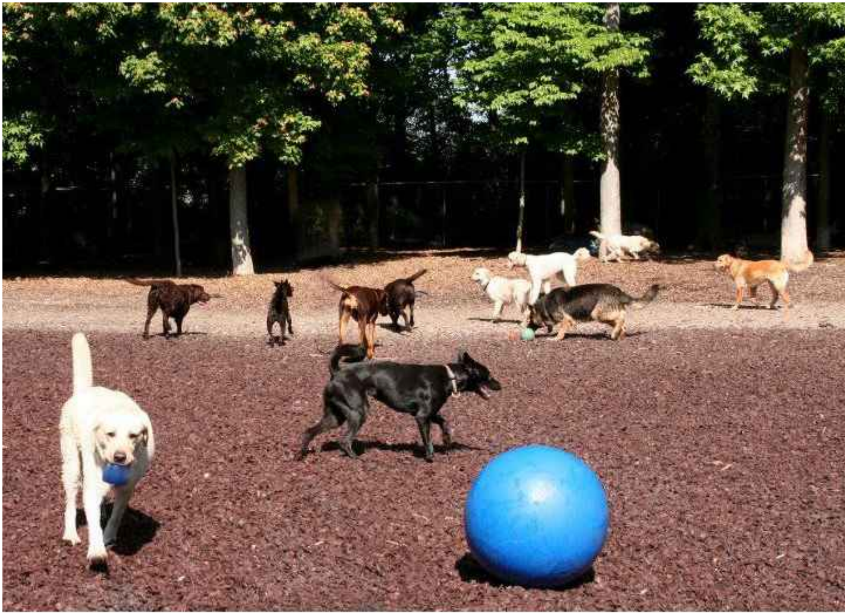
MULCHED DOG LEASH FREE AREA ENTRANCE