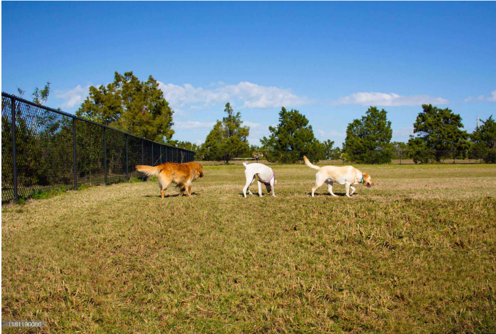
FENCED DOG LEASH FREE AREAS