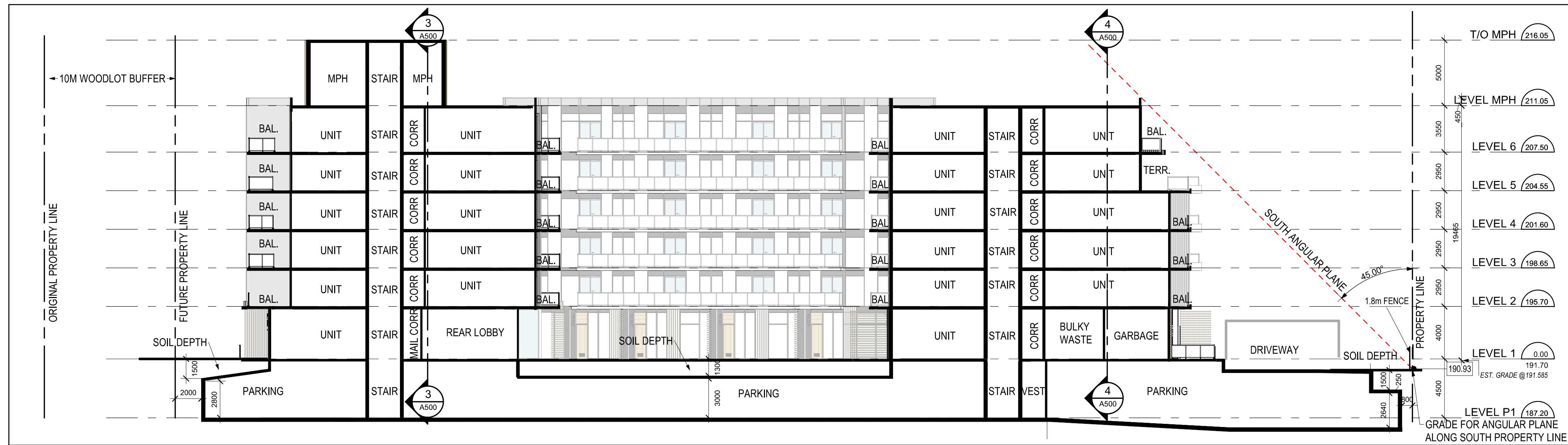
Courtyard Longitudinal Section 2 1 : 200 A500