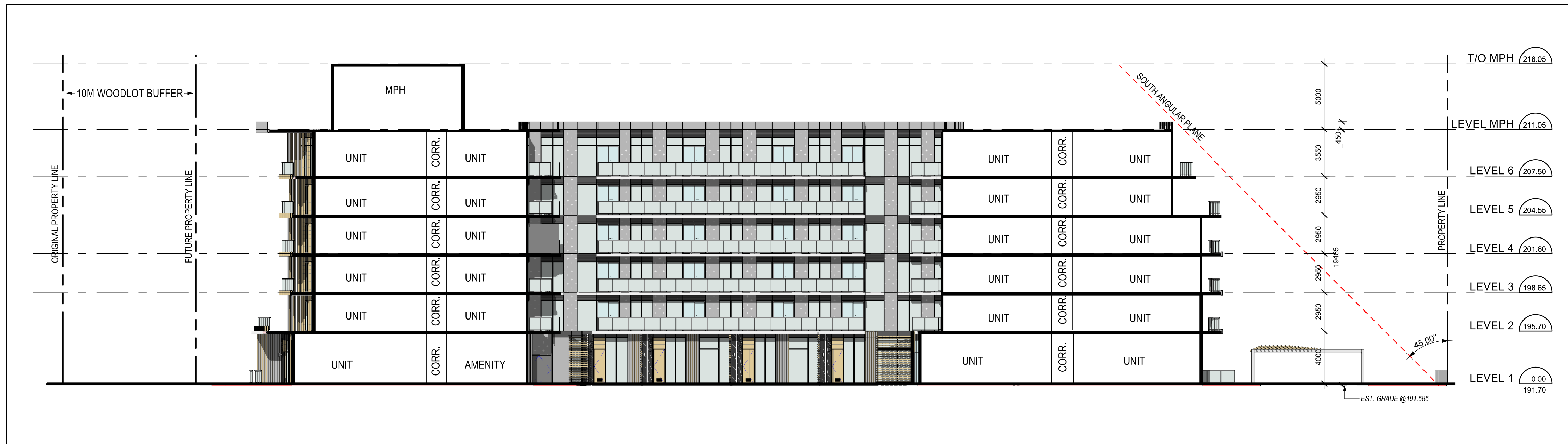
West Courtyard Elevation 2 1 : 200 A401