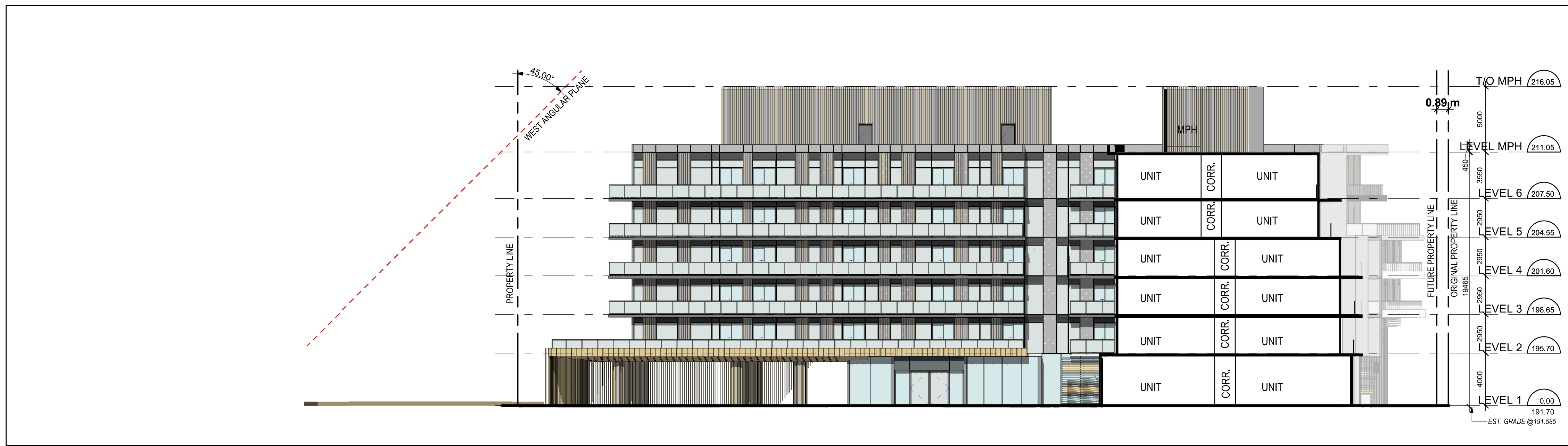
South Courtyard Elevation 3 1 : 200 A401