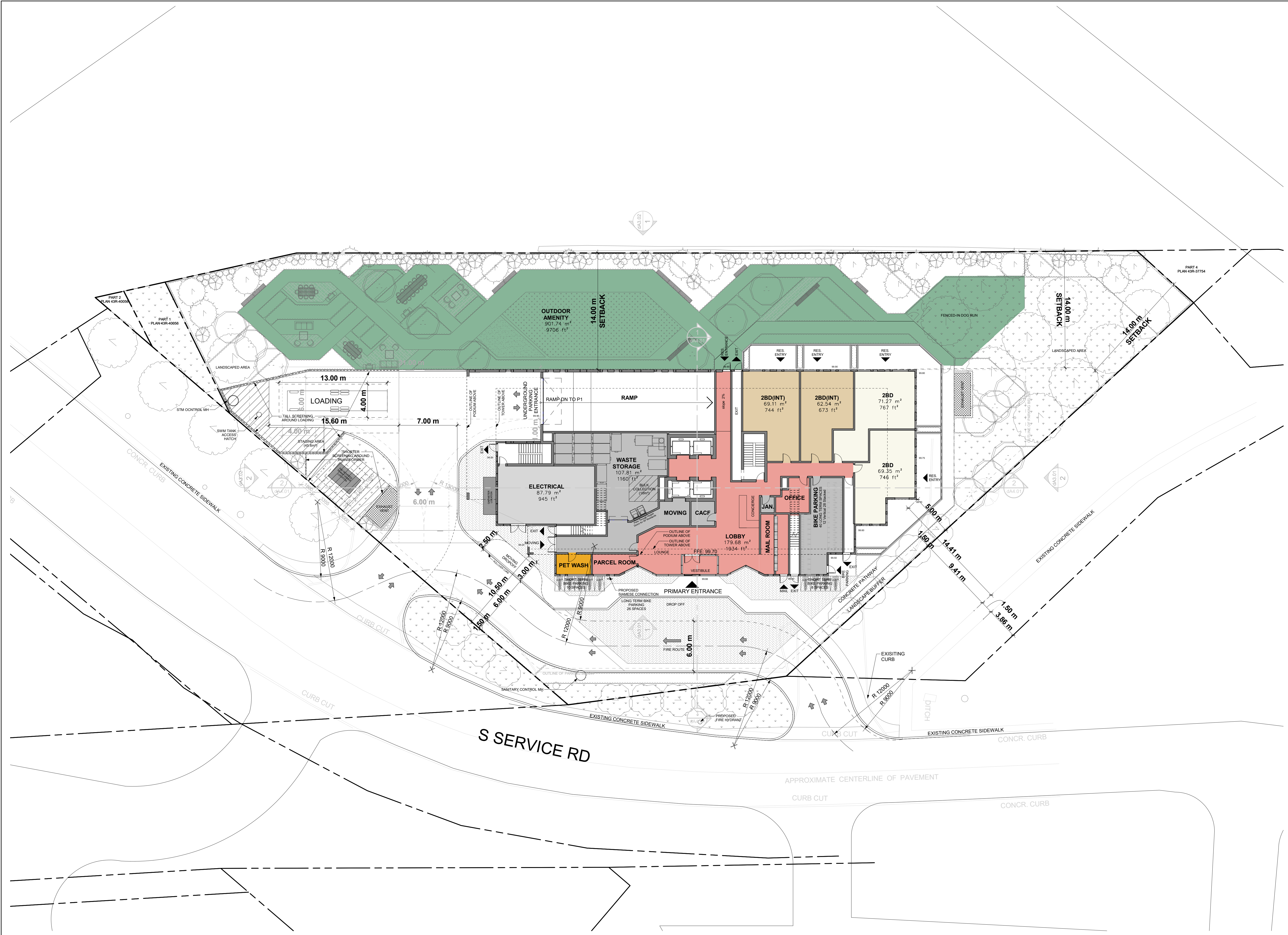
12 A2 Floor Plan - Level 1 1 : 200 1 dA2.04