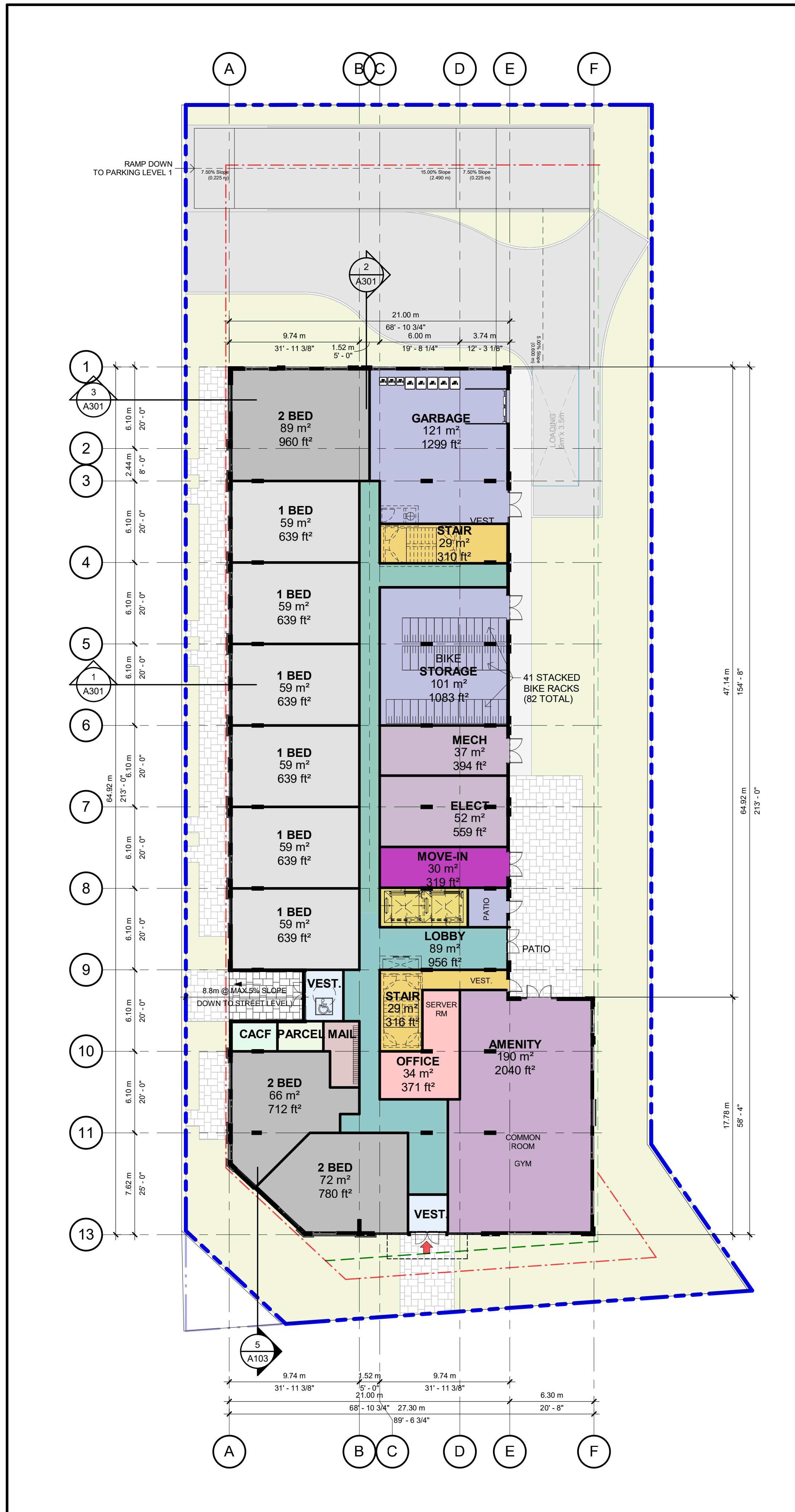
1 GROUND FLOOR PLAN A100 1 : 200