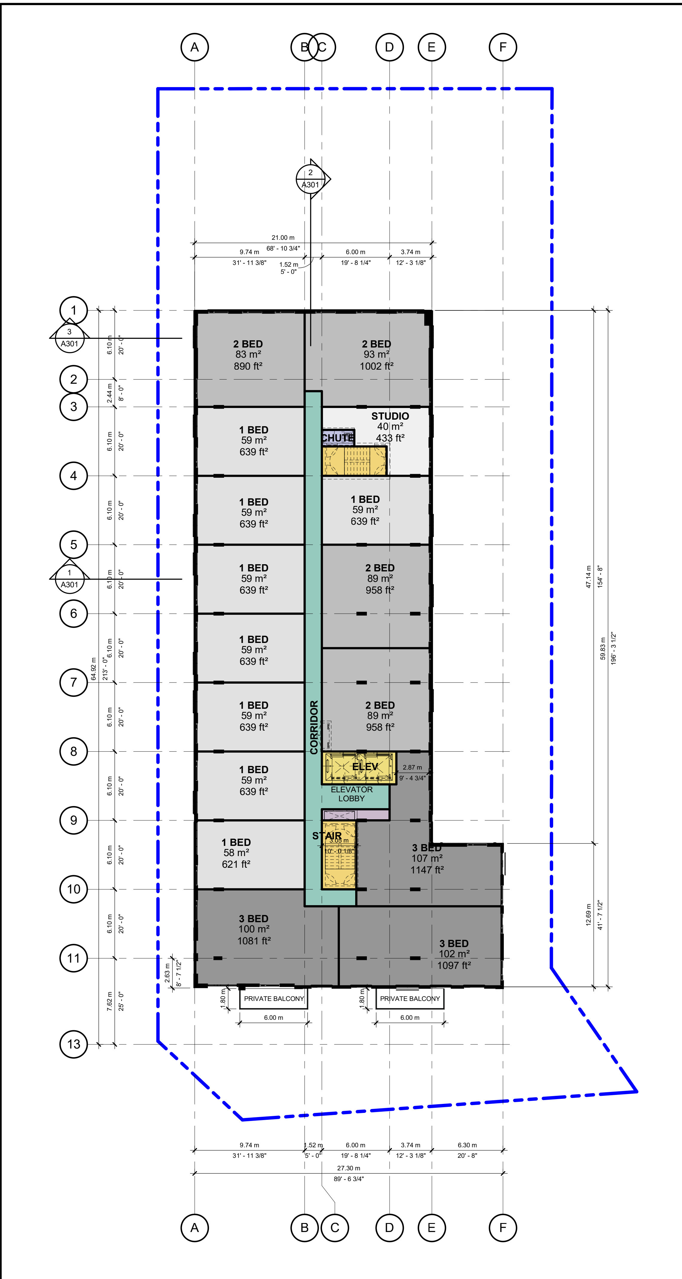
2 6th-8th FLOOR PLAN A101 1 : 200