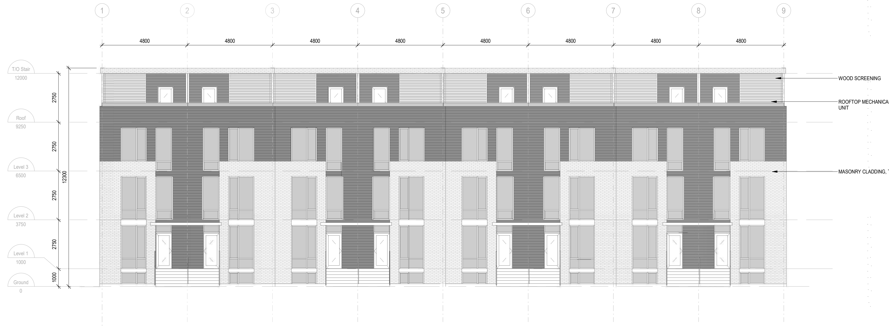
1 Elevation - East 1:100