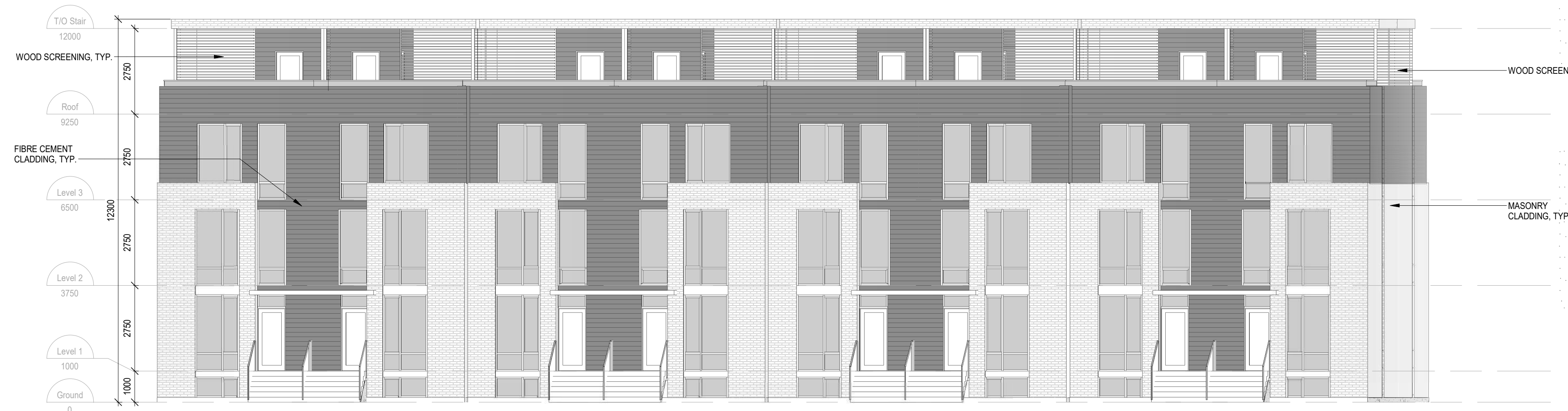
2 Elevation - West 1:100