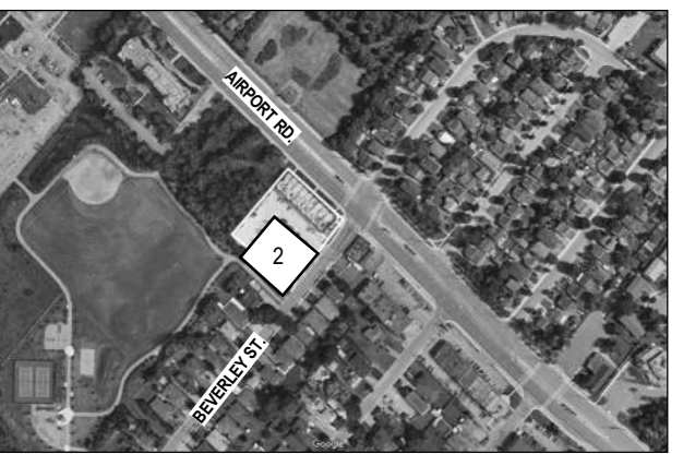
KEY PLAN NTS

Cumulus will not be liable for any claims or damages arising from the unauthorized use of this drawing or any portion thereof.