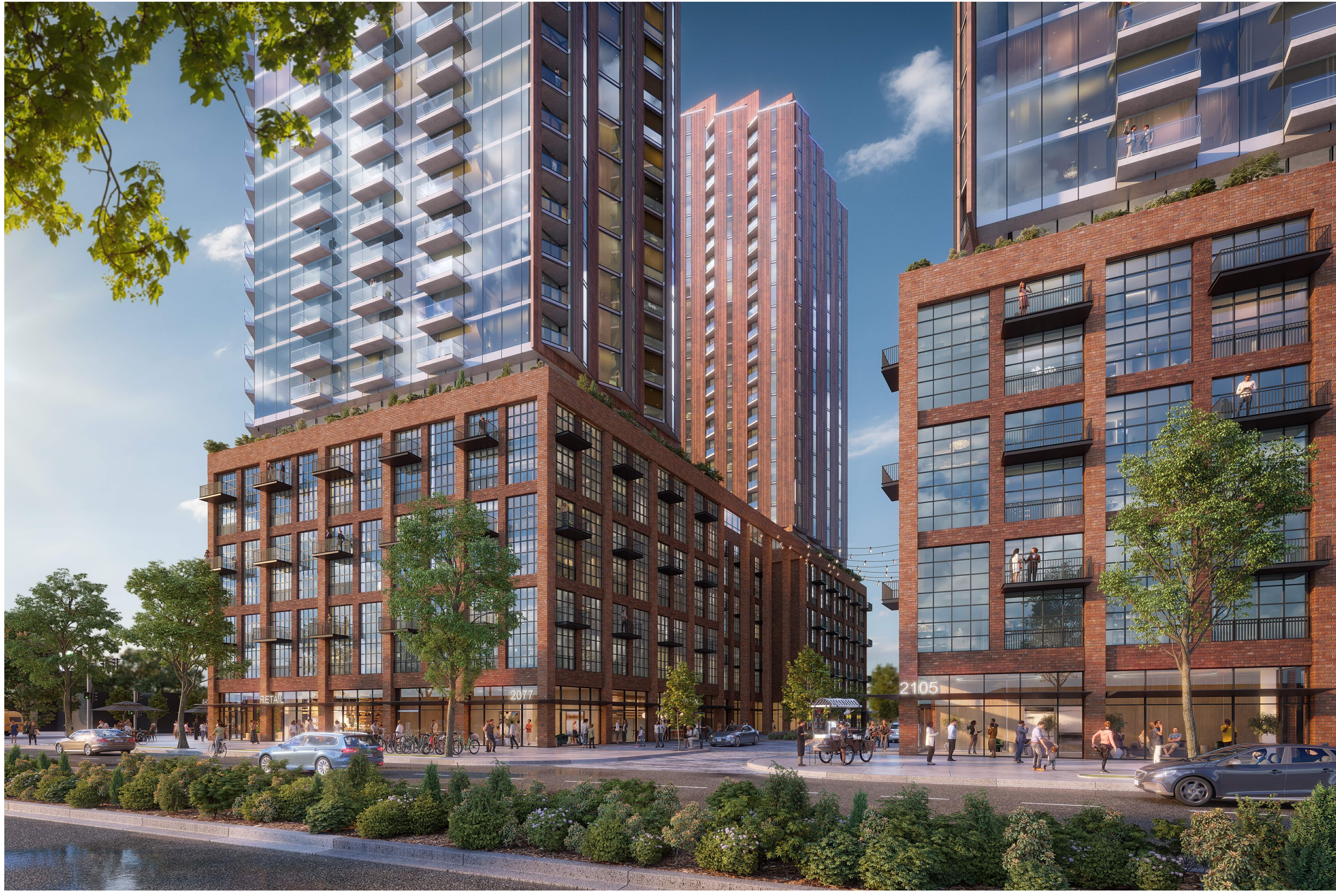
STREET LEVEL VIEW FROM SE CORNER