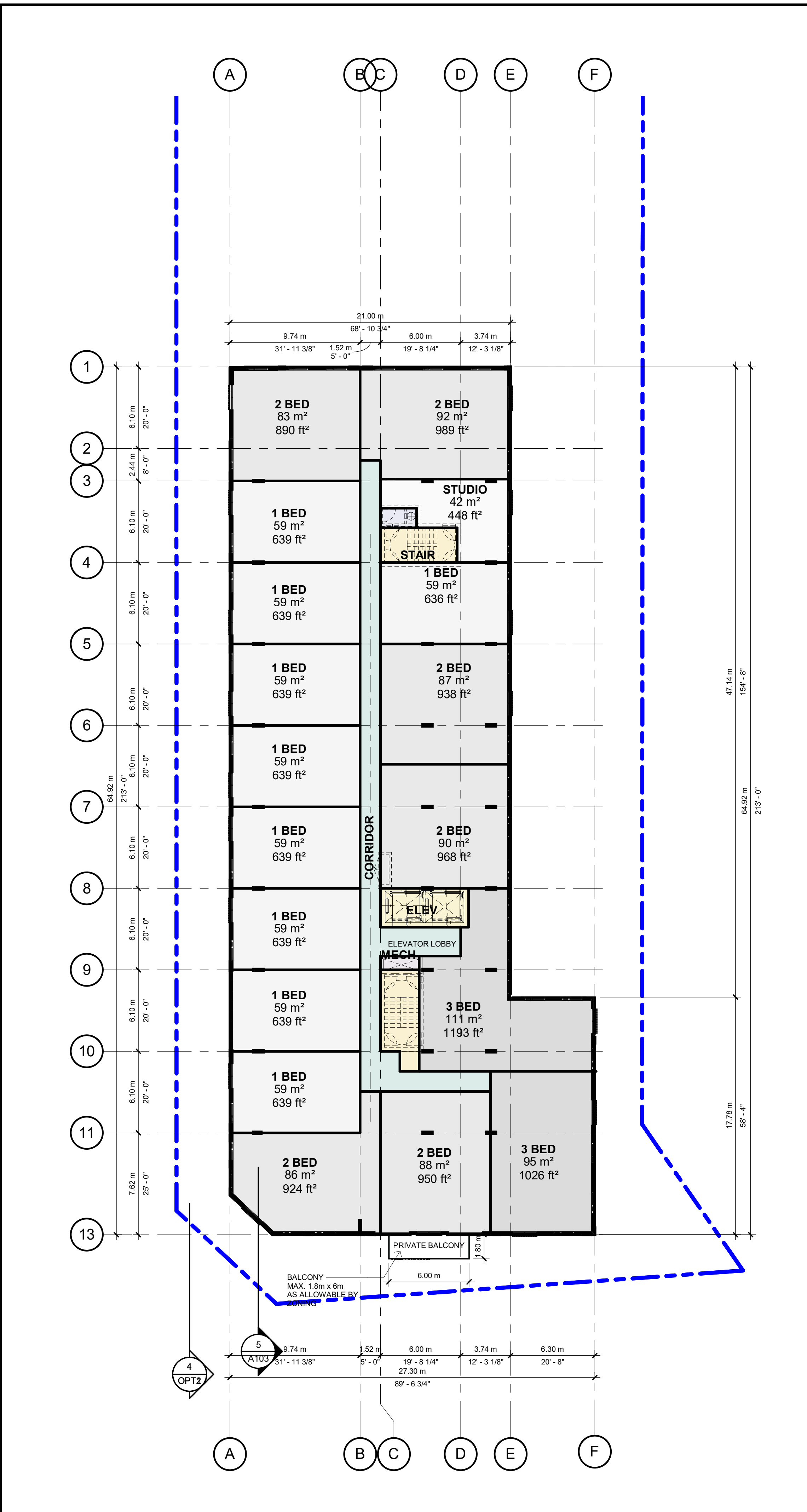
2 2nd TO 4th FLOOR PLAN (TYPICAL) A100 1 : 200

C:\Users\mjiang\Documents\121027 - 1303 Lakeshore MISS - Bulding - 2023.02.07 - mcs@chamberlainipd.com