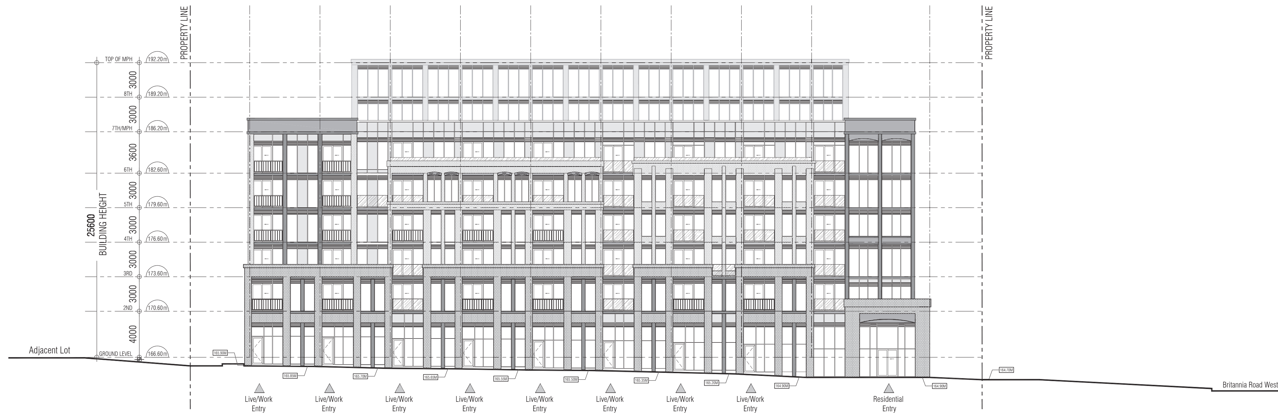
QUEEN STREET ELEVATION 1 1:200 A401