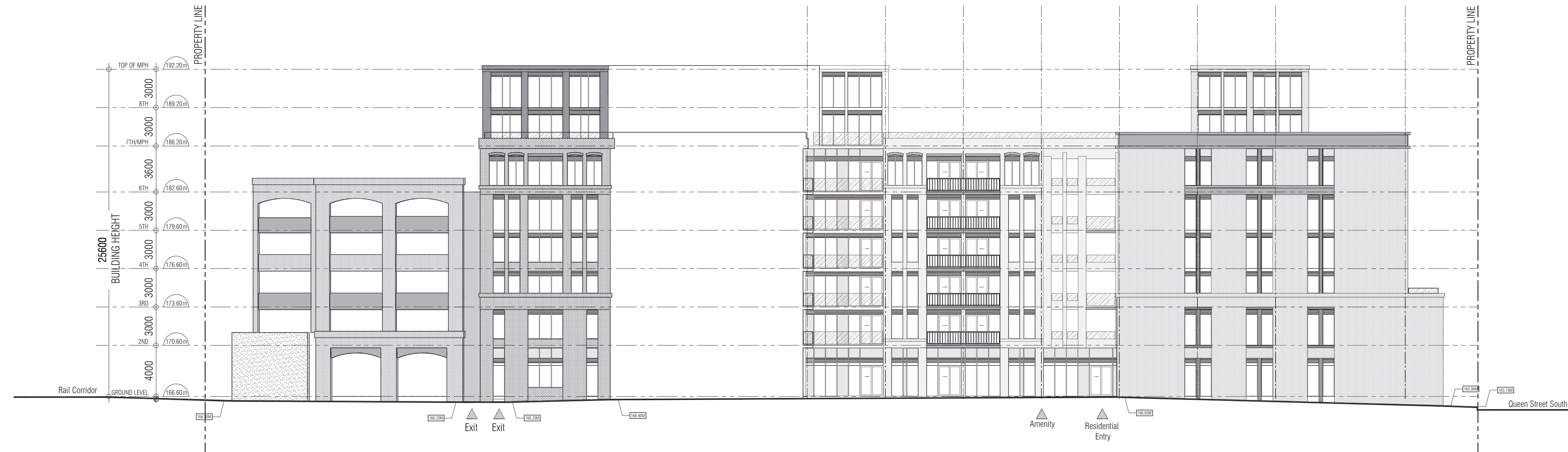
ELEVATION FACING JAMES STREET 1 1:200 A403

THIS DRAWING, AS AN INSTRUMENT OF SERVICE, IS PROVIDED BY AND IS THE PROPERTY OF GRAZIANI-CORAZZA ARCHITECTS INC. THE CONTRACTOR MUST VERIFY AND ACCEPT RESPONSIBILITY FOR ALL DIMENSIONS AND CONDITIONS ON SITE AND MUST NOTIFY GRAZIANI-CORAZZA ARCHITECTS INC. OF ANY VARIATIONS FROM THE SUPPLIED INFORMATION. GRAZIANI-CORAZZA ARCHITECTS INC. IS NOT RESPONSIBLE FOR THE ACCURACY OF SURVEY, STRUCTURAL, MECHANICAL, ELECTRICAL, AND OTHER ENGINEERING INFORMATION SHOWN ON THIS DRAWING. REFER TO THE APPROPRIATE ENGINEERING DRAWINGS BEFORE PROCEEDING WITH THE WORK. CONSTRUCTION MUST CONFORM TO ALL APPLICABLE CODES AND REQUIREMENTS OF THE AUTHORITIES HAVING JURISDICTION, UNLESS OTHERWISE NOTED. NO INVESTIGATION HAS BEEN UNDERTAKEN OR REPORTED ON BY THIS OFFICE IN REGARDS TO THE ENVIRONMENTAL CONDITION OF THIS SITE.