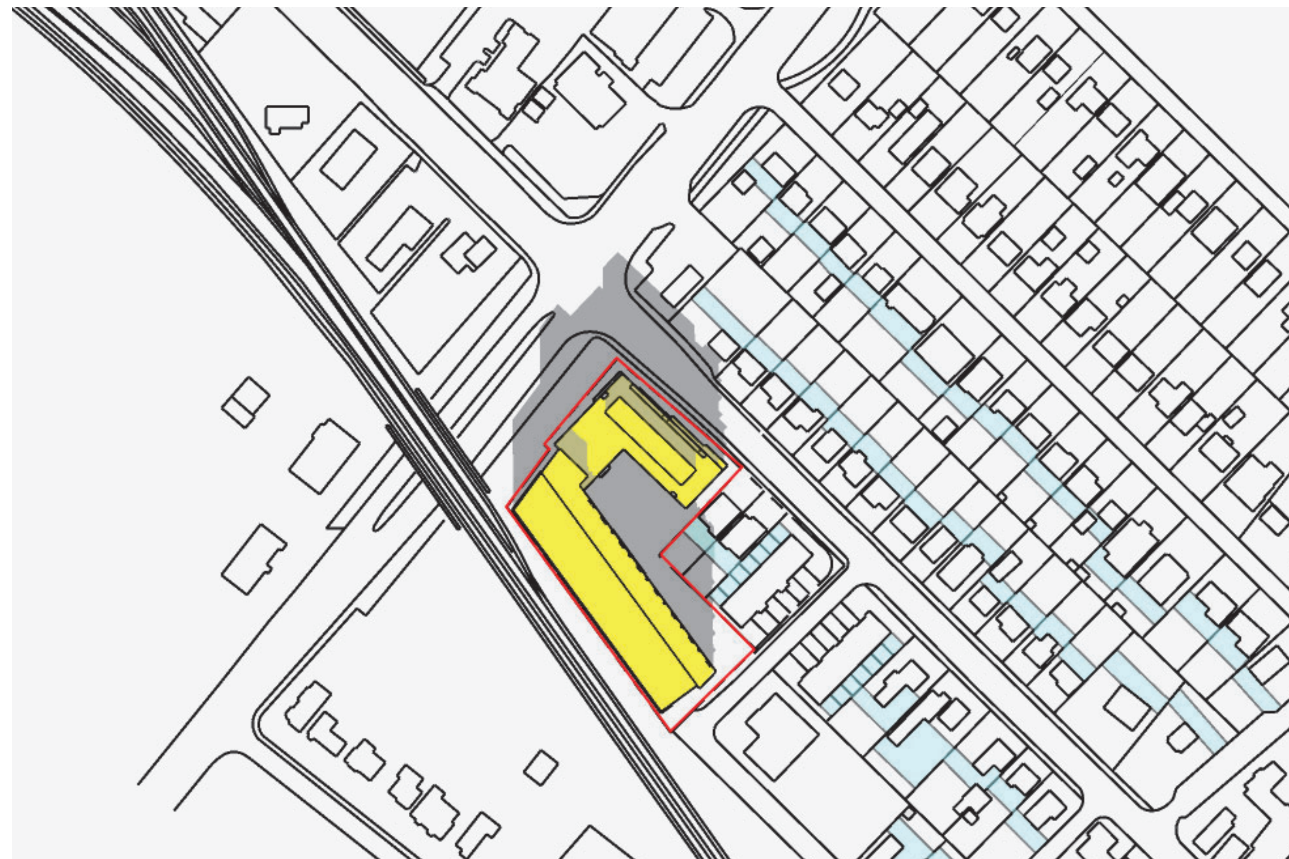
DECEMBER 21 12:17 4 1:1500 A708

THIS DRAWING, AS AN INSTRUMENT OF SERVICE, IS PROVIDED BY AND IS THE PROPERTY OF GRAZIANI-CORAZZA ARCHITECTS INC. THE CONTRACTOR MUST VERIFY AND ACCEPT RESPONSIBILITY FOR ALL DIMENSIONS AND CONDITIONS ON SITE AND MUST NOTIFY GRAZIANI-CORAZZA ARCHITECTS INC. OF ANY VARIATIONS FROM THE SUPPLIED INFORMATION. GRAZIANI-CORAZZA ARCHITECTS INC. IS NOT RESPONSIBLE FOR THE ACCURACY OF SURVEY, STRUCTURAL, MECHANICAL, ELECTRICAL, AND OTHER ENGINEERING INFORMATION SHOWN ON THIS DRAWING. REFER TO THE APPROPRIATE ENGINEERING DRAWINGS BEFORE PROCEEDING WITH THE WORK. CONSTRUCTION MUST CONFORM TO ALL APPLICABLE CODES AND REQUIREMENTS OF THE AUTHORITIES HAVING JURISDICTION. UNLESS OTHERWISE NOTED, NO INVESTIGATION HAS BEEN UNDERTAKEN OR REPORTED ON BY THIS OFFICE IN REGARD TO THE ENVIRONMENTAL CONDITION OF THIS SITE.