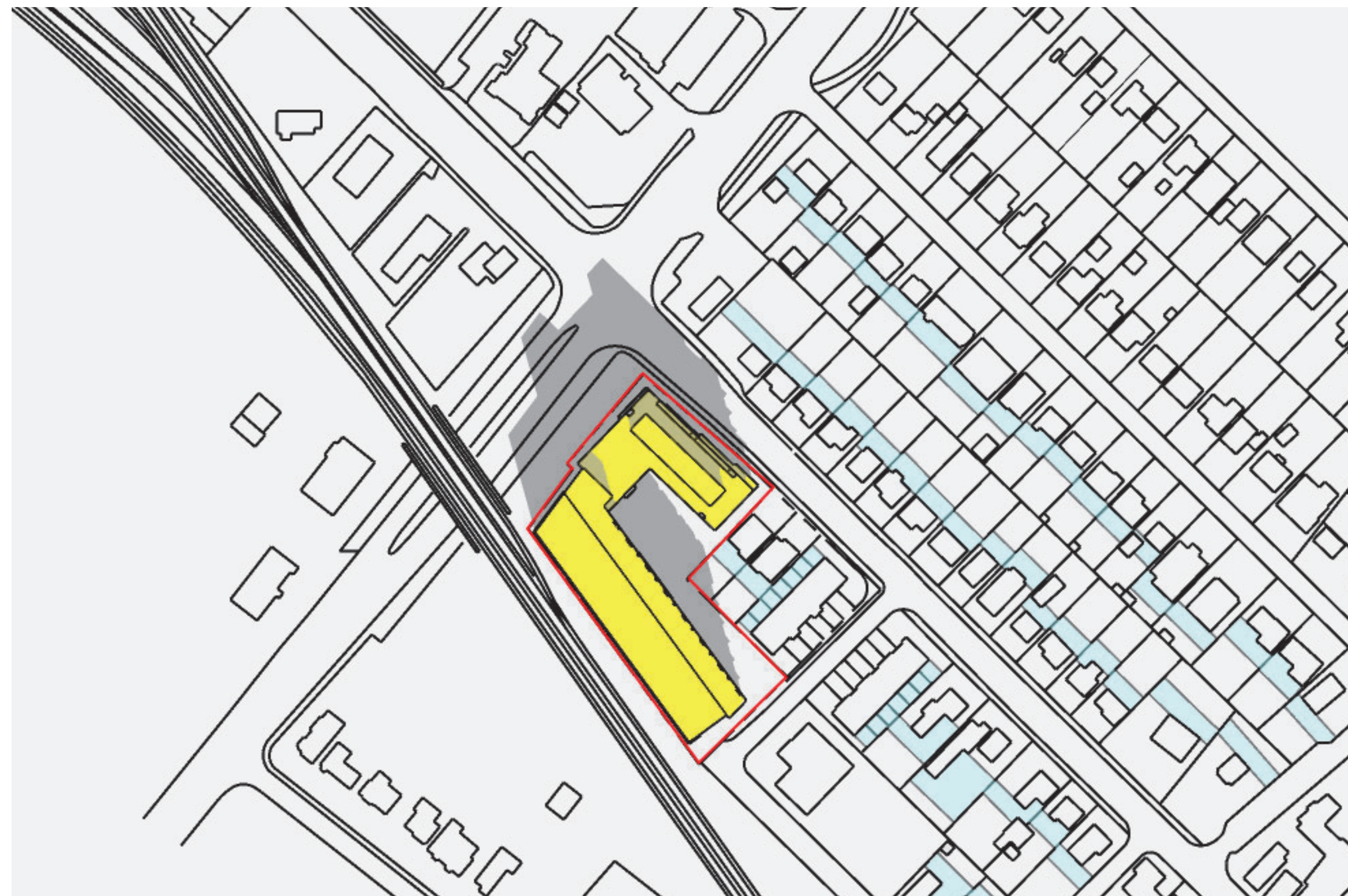
DECEMBER 21 11:17 3 1:1500 A708