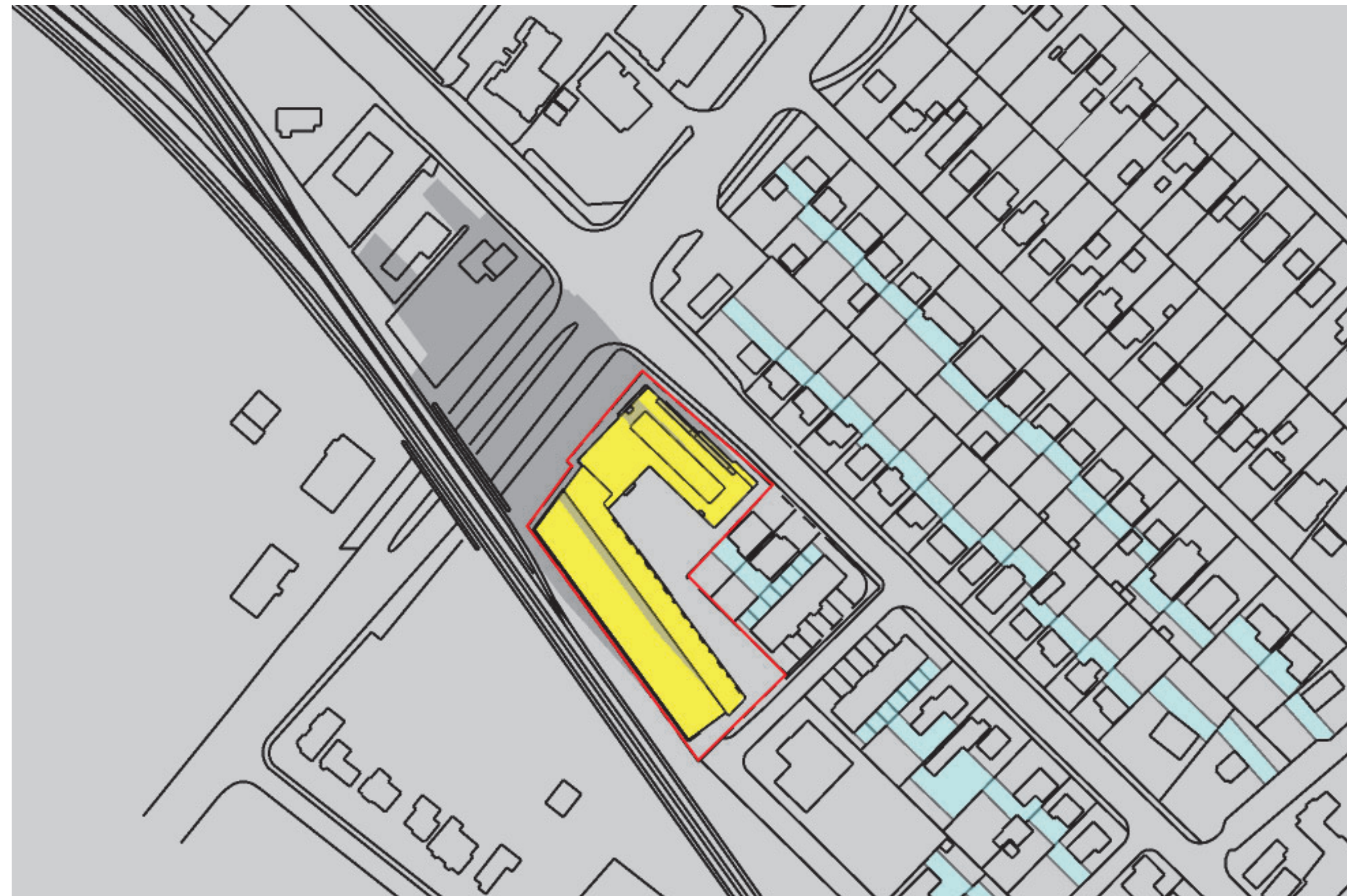
DECEMBER 21 09:19 1 1:1500 A708