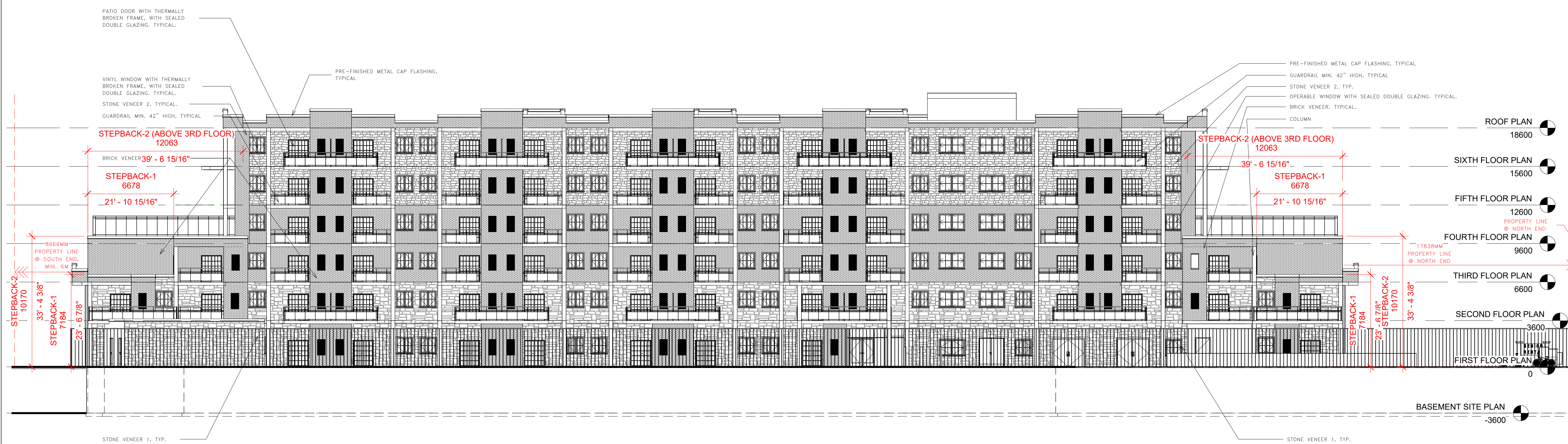
3 EAST ELEVATION 1 : 150