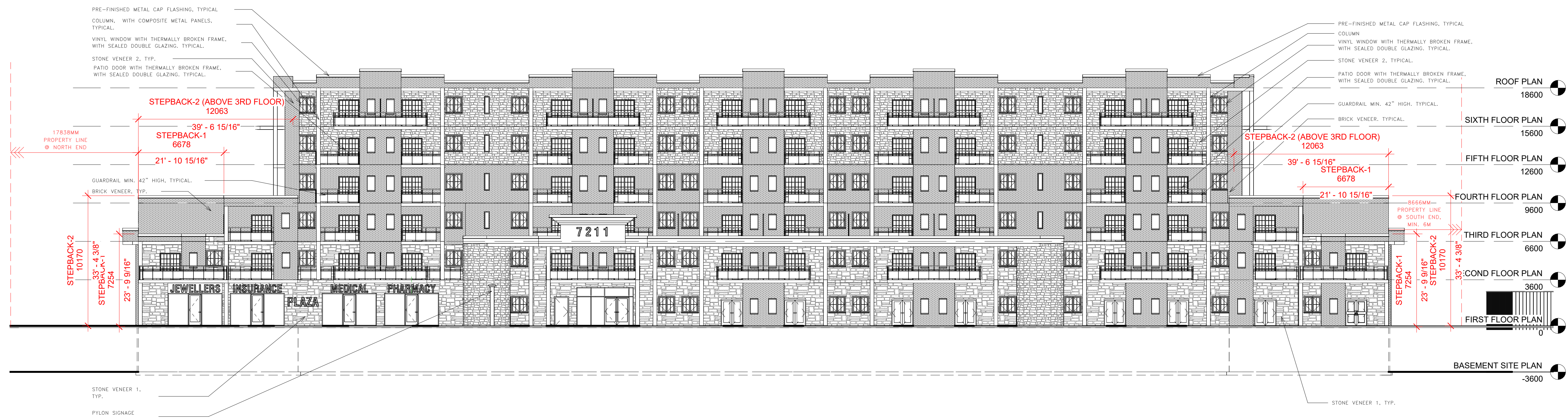
1 WEST ELEVATION 1 : 150