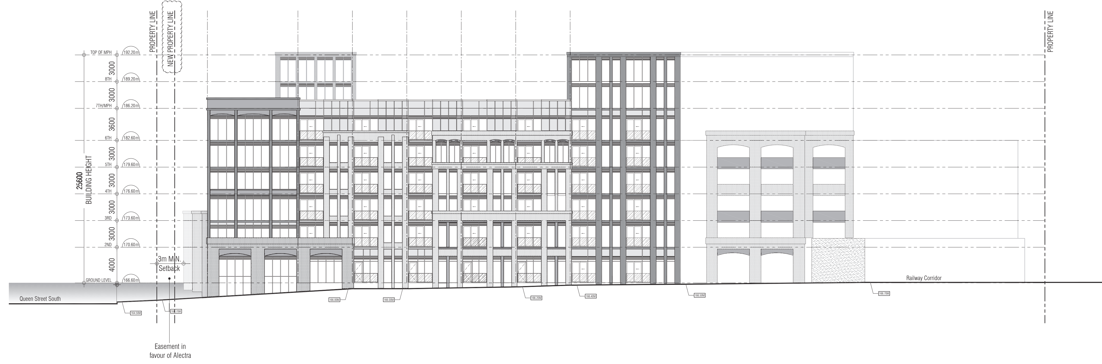
BRITANNIA STREET ELEVATION 2 1:200 A401