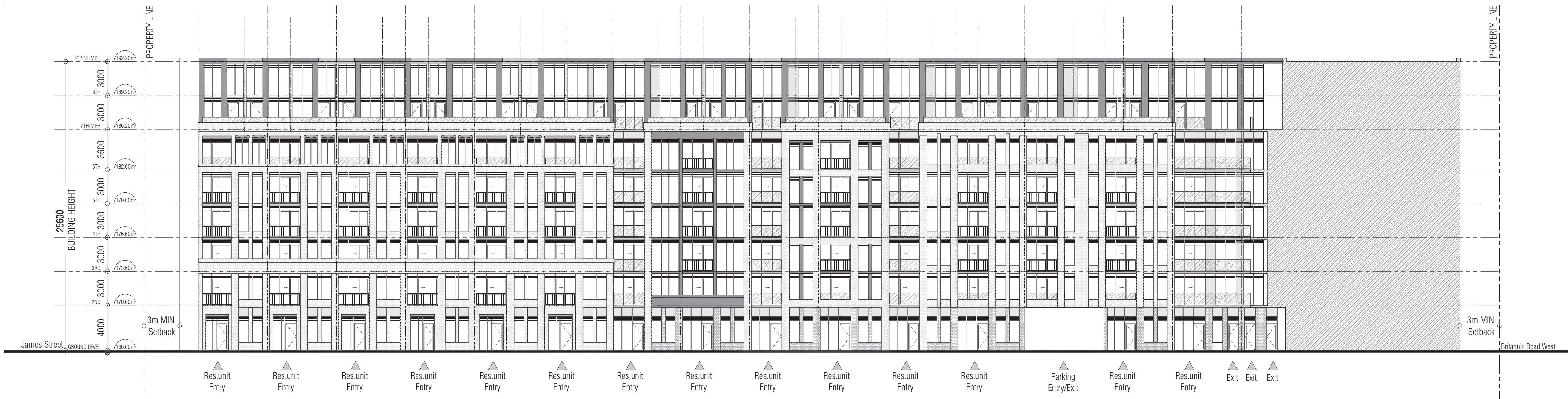
INTERNAL ELEVATION 1 1:200 A402