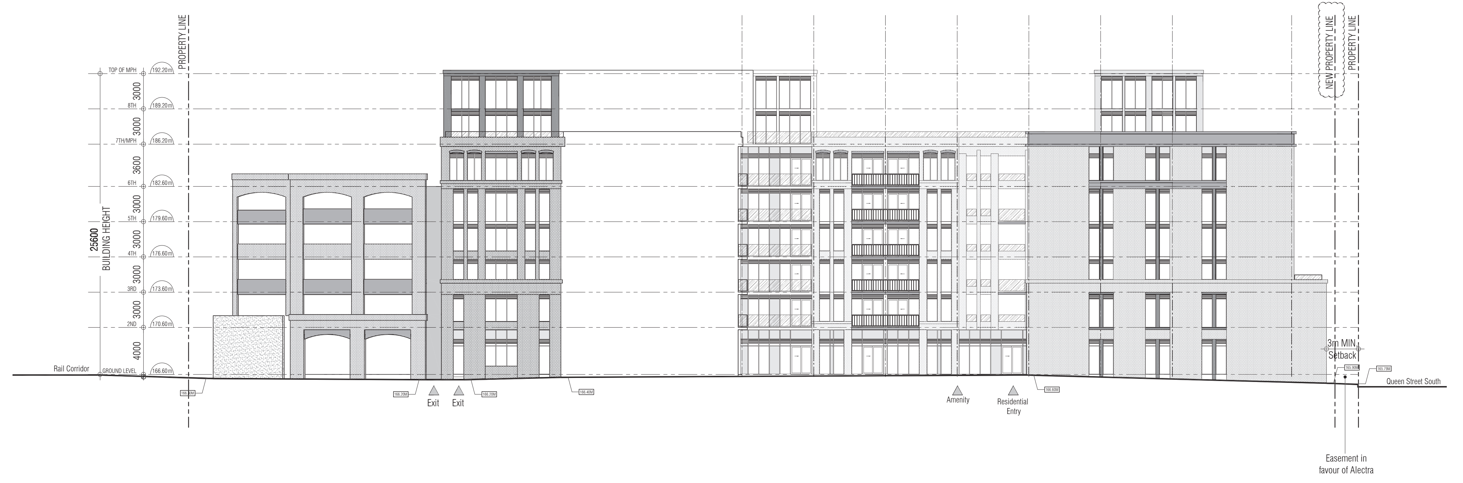
ELEVATION FACING JAMES STREET 1 A403 1:200

THIS DRAWING, AS AN INSTRUMENT OF SERVICE, IS PROVIDED BY AND IS THE PROPERTY OF GRAZIANI-CORAZZA ARCHITECTS INC. THE CONTRACTOR MUST VERIFY AND ACCEPT RESPONSIBILITY FOR ALL DIMENSIONS AND CONDITIONS ON SITE AND MUST NOTIFY GRAZIANI-CORAZZA ARCHITECTS INC. OF ANY VARIATIONS FROM THE SUPPLIED INFORMATION. GRAZIANI-CORAZZA ARCHITECTS INC. IS NOT RESPONSIBLE FOR THE ACCURACY OF SURVEY, STRUCTURAL, MECHANICAL, ELECTRICAL, AND OTHER ENGINEERING INFORMATION SHOWN ON THIS DRAWING. REFER TO THE APPROPRIATE ENGINEERING DRAWINGS BEFORE PROCEEDING WITH THE WORK. CONSTRUCTION MUST CONFORM TO ALL APPLICABLE CODES AND REQUIREMENTS OF THE AUTHORITIES HAVING JURISDICTION, UNLESS OTHERWISE NOTED. NO INVESTIGATION HAS BEEN UNDERTAKEN OR REPORTED ON BY THIS OFFICE IN REGARDS TO THE ENVIRONMENTAL CONDITION OF THIS SITE.