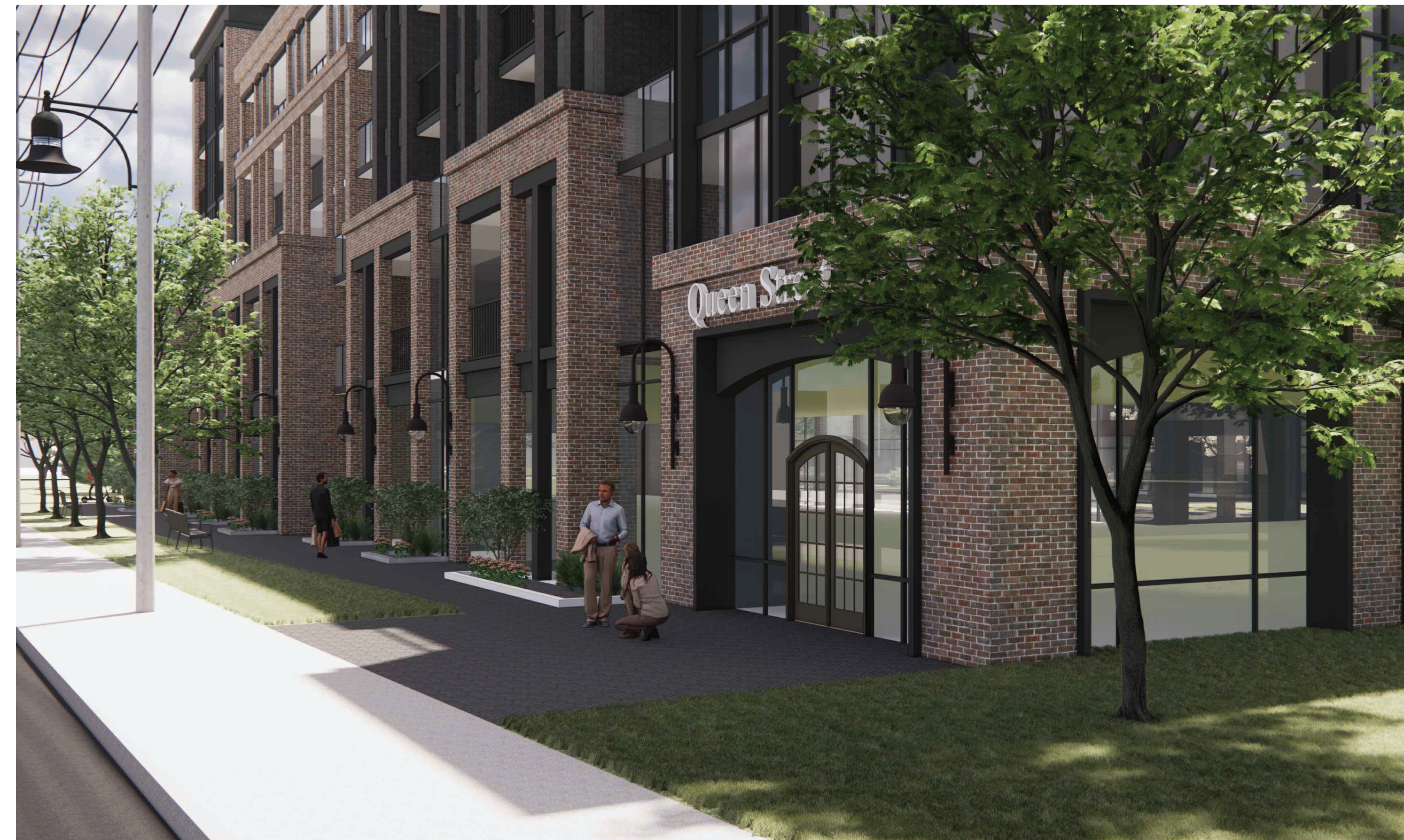
VIEW OF QUEEN STREET RESIDENTIAL ENTRY 4 A405

THIS DRAWING, AS AN INSTRUMENT OF SERVICE, IS PROVIDED BY AND IS THE PROPERTY OF GRAZIANI-CORAZZA ARCHITECTS INC. THE CONTRACTOR MUST VERIFY AND ACCEPT RESPONSIBILITY FOR ALL DIMENSIONS AND CONDITIONS ON SITE AND MUST NOTIFY GRAZIANI-CORAZZA ARCHITECTS INC. OF ANY VARIATIONS FROM THE SUPPLIED INFORMATION. GRAZIANI-CORAZZA ARCHITECTS INC. IS NOT RESPONSIBLE FOR THE ACCURACY OF SURVEY, STRUCTURAL, MECHANICAL, ELECTRICAL, AND OTHER ENGINEERING INFORMATION SHOWN ON THIS DRAWING. REFER TO THE APPROPRIATE ENGINEERING DRAWINGS BEFORE PROCEEDING WITH THE WORK. CONSTRUCTION MUST CONFORM TO ALL APPLICABLE CODES AND REQUIREMENTS OF THE AUTHORITIES HAVING JURISDICTION, UNLESS OTHERWISE NOTED. NO INVESTIGATION HAS BEEN UNDERTAKEN OR REPORTED ON BY THIS OFFICE IN REGARDS TO THE ENVIRONMENTAL CONDITION OF THIS SITE.