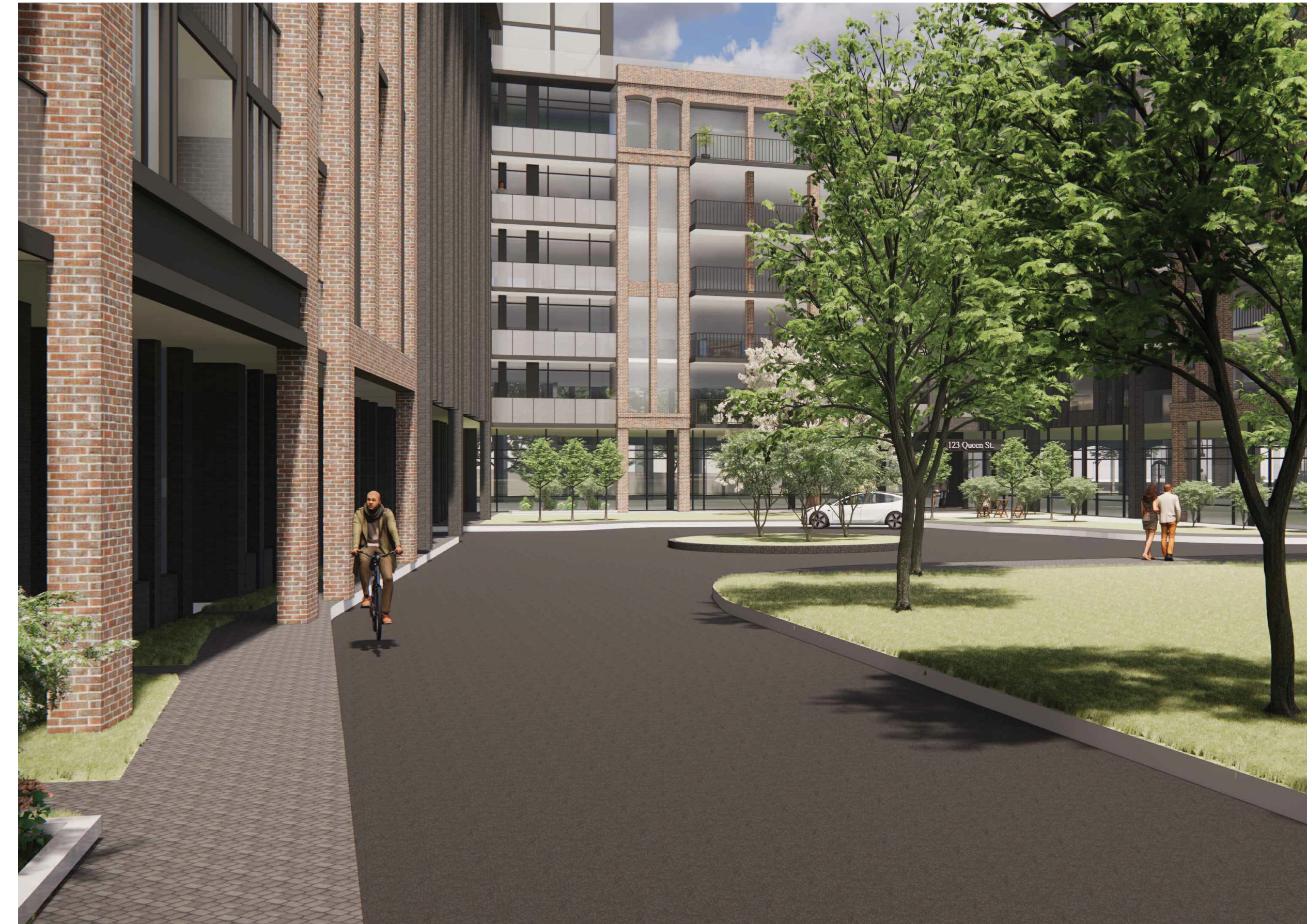
VIEW INTO RESIDENTIAL COURTYARD 2 A405