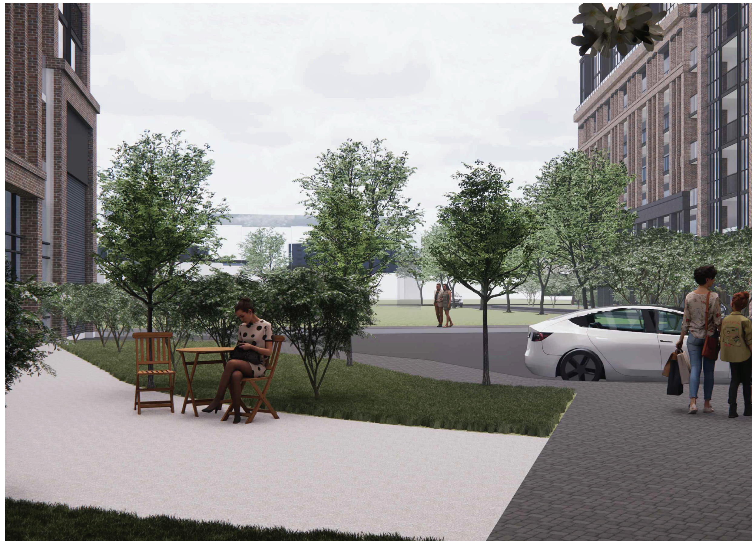
VIEW LOOKING OUT FROM COURTYARD ENTRANCE 3 A405