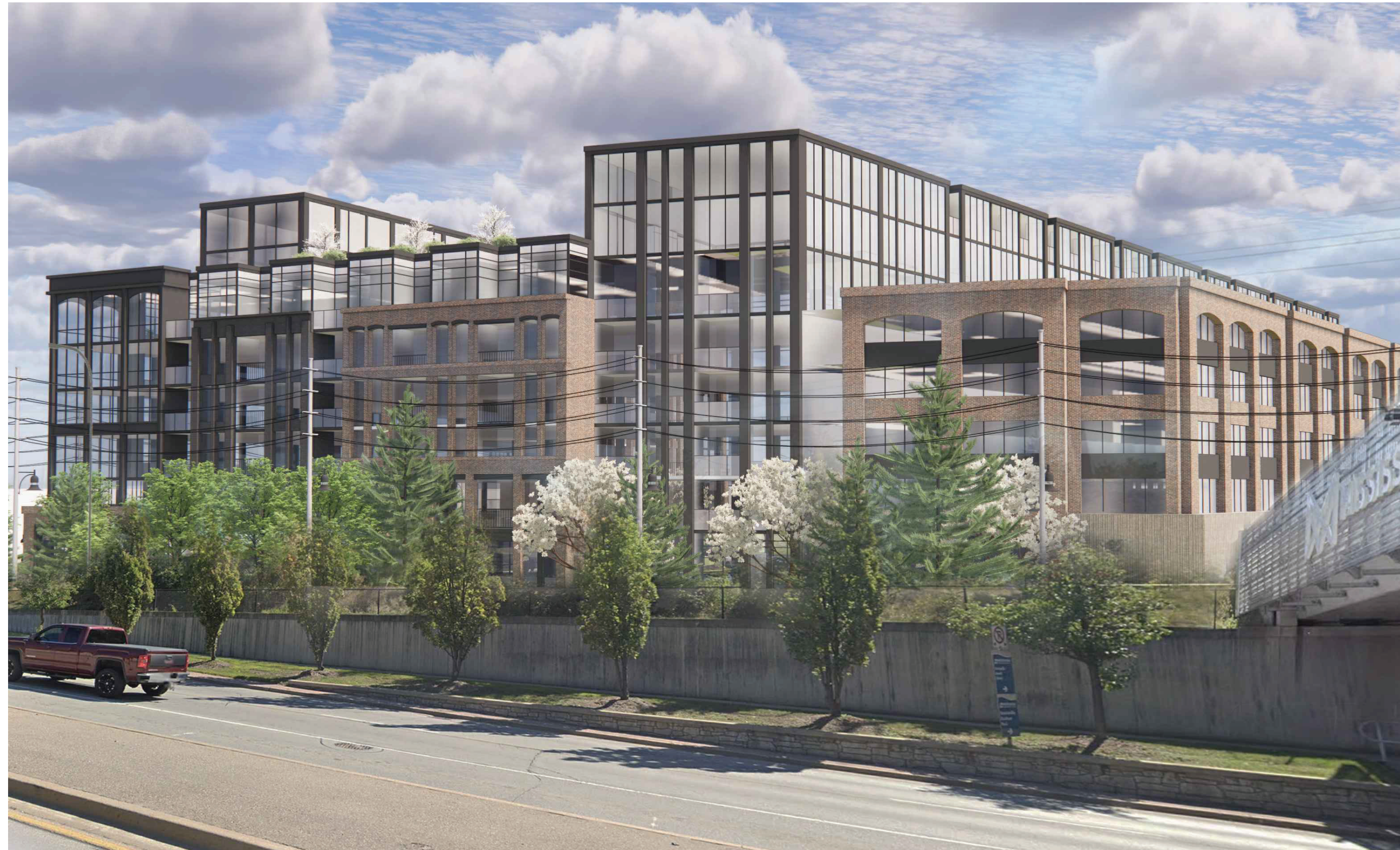
VIEW FROM BRITANNIA ROAD WEST 1 A405