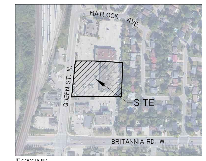
LOCATION PLAN N.T.S.

TRENCH DRAINS SHALL BE ZURN Z886 OR APPROVED EQUAL.