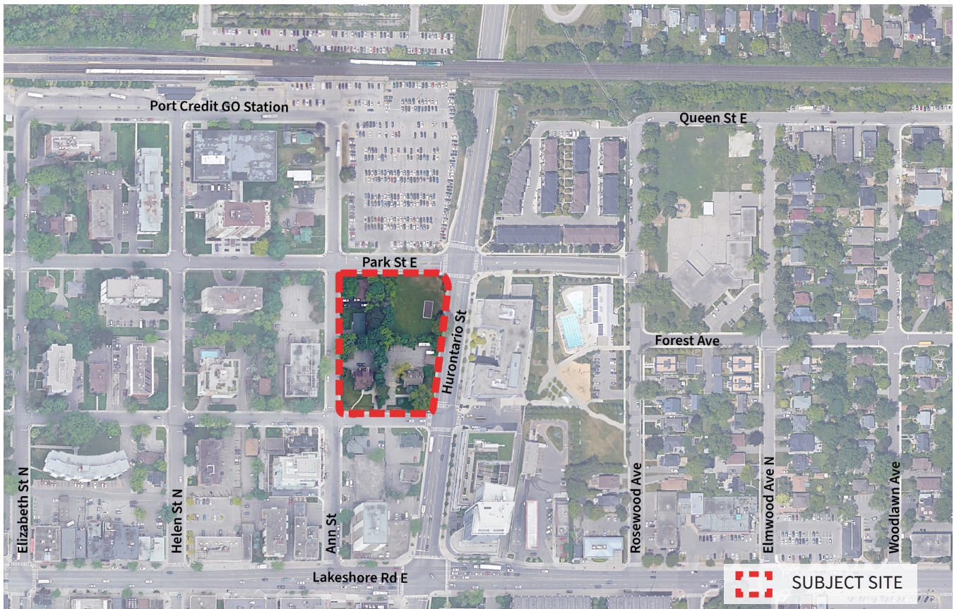
Figure 1. Aerial map showing the Subject Site boundaries and the surrounding Port Credit context

At the northeast corner of the block is a vacant City-owned parcel that is approximately 2,450 square metres in size. This parcel of land is municipally known as 91 Park Street East and it fronts onto Park Street East and Hurontario Street. The parcel is square in shape and contains a grassy open area as well as trees along the south and west edges of the parcel.