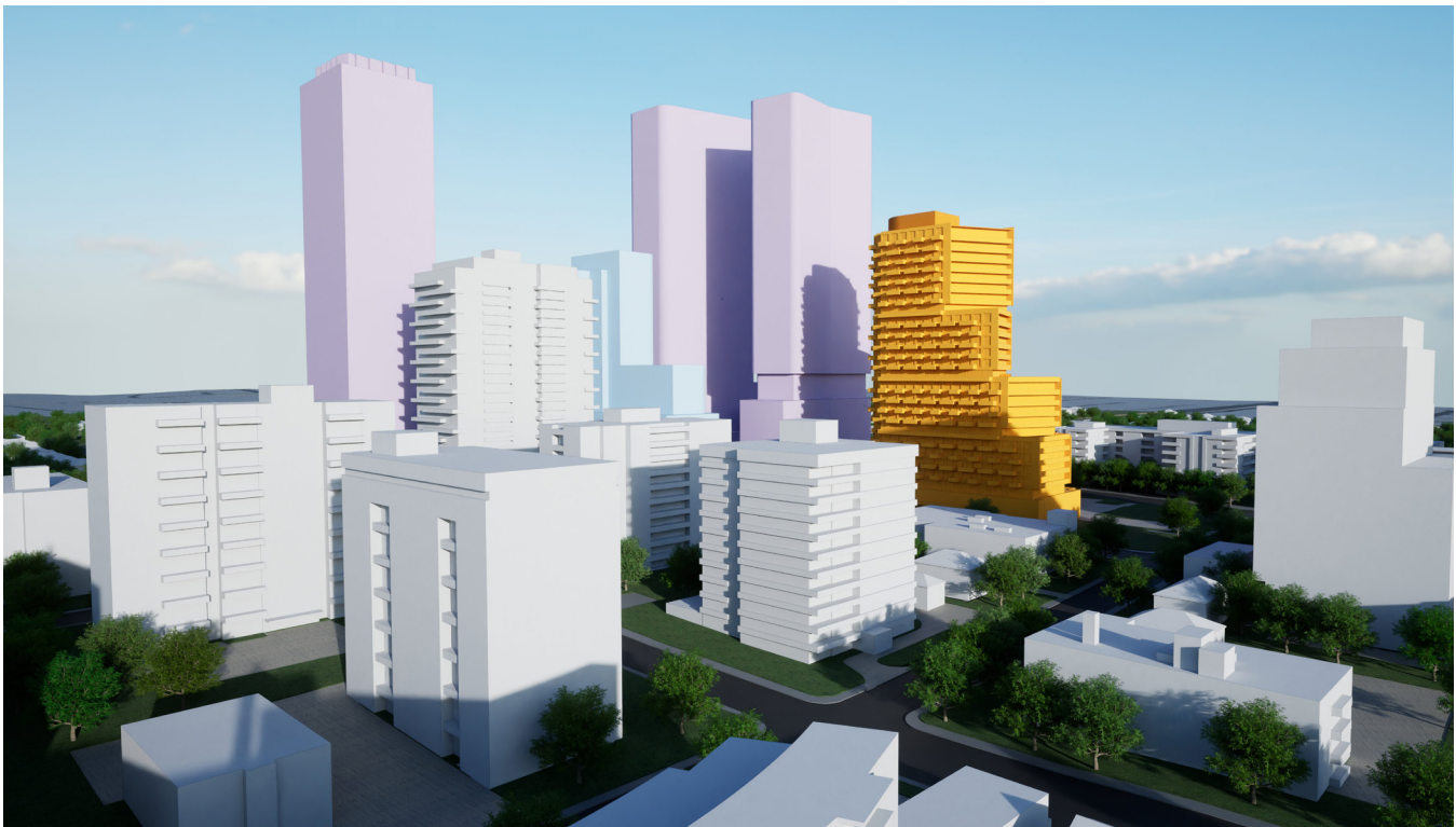
Figure 2. 3D rendering showing the Revised Proposal in context