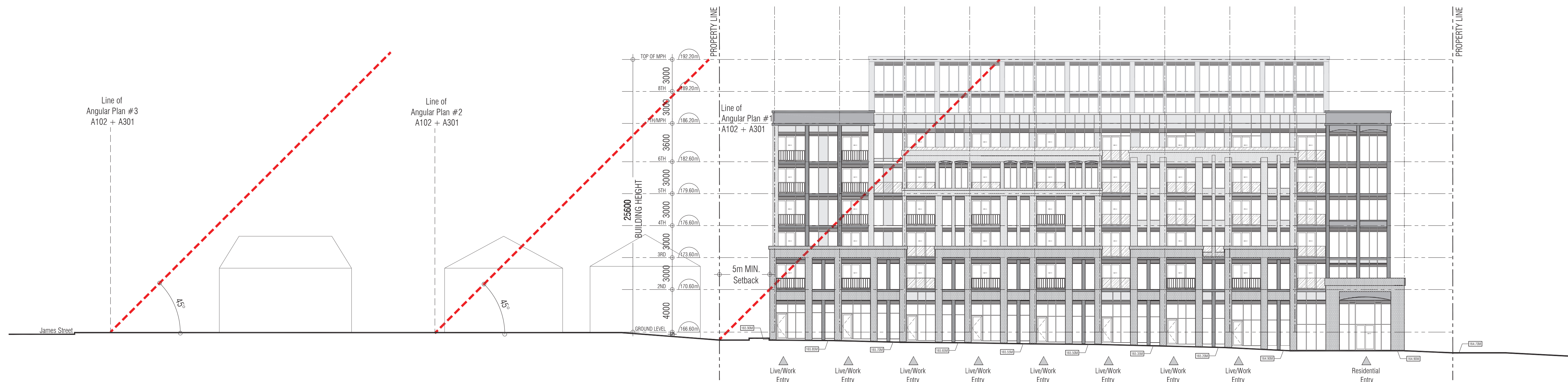
QUEEN STREET ELEVATION 1 1:200 A401