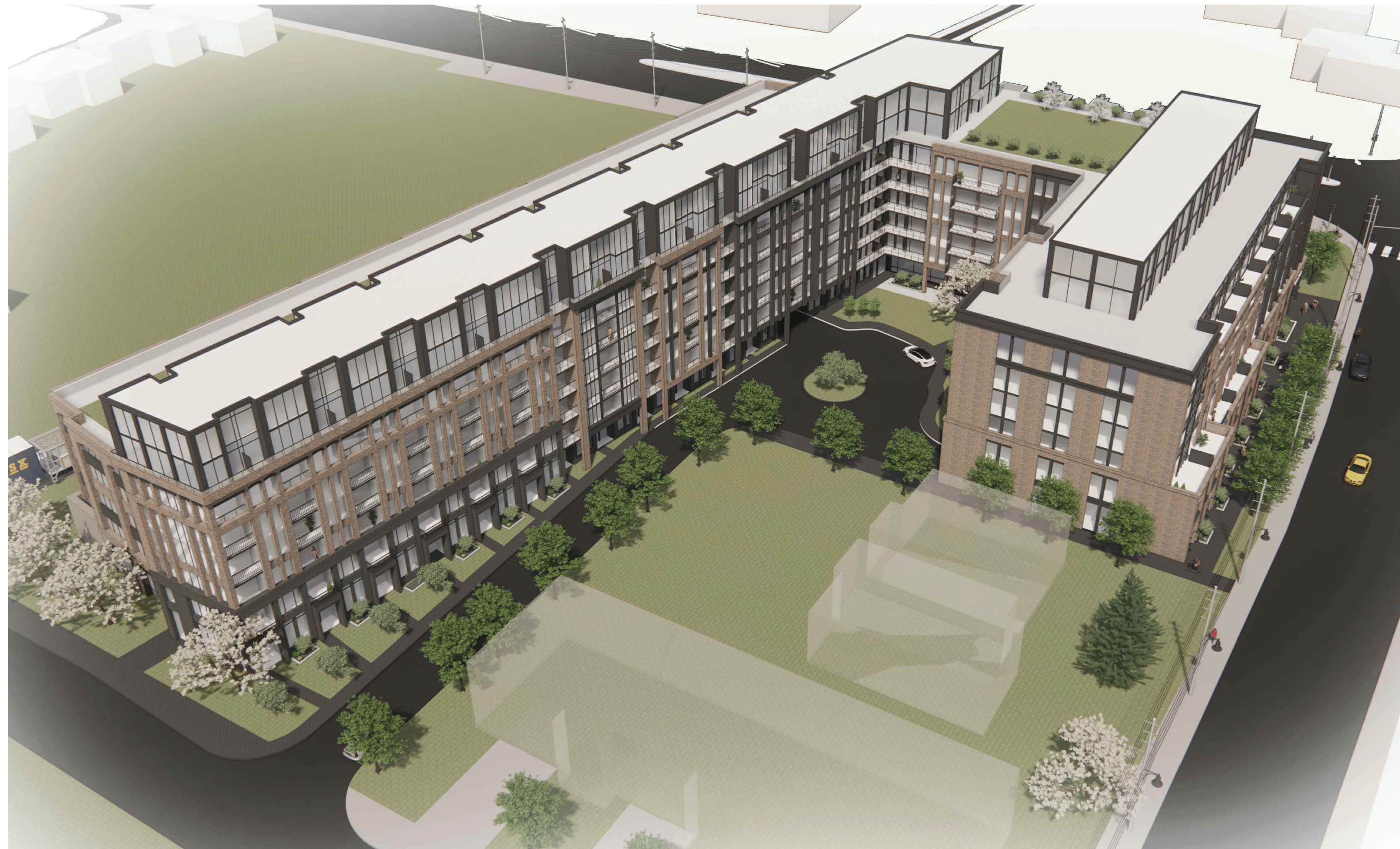
AERIAL VIEW - PROPOSAL 2 A404

THIS DRAWING, AS AN INSTRUMENT OF SERVICE, IS PROVIDED BY AND IS THE PROPERTY OF GRAZIANI-CORAZZA ARCHITECTS INC. THE CONTRACTOR MUST VERIFY AND ACCEPT RESPONSIBILITY FOR ALL DIMENSIONS AND CONDITIONS ON SITE AND MUST NOTIFY GRAZIANI-CORAZZA ARCHITECTS INC. OF ANY VARIATIONS FROM THE SUPPLIED INFORMATION. GRAZIANI-CORAZZA ARCHITECTS INC. IS NOT RESPONSIBLE FOR THE ACCURACY OF SURVEY, STRUCTURAL, MECHANICAL, ELECTRICAL, AND OTHER ENGINEERING INFORMATION SHOWN ON THIS DRAWING. REFER TO THE APPROPRIATE ENGINEERING DRAWINGS BEFORE PROCEEDING WITH THE WORK. CONSTRUCTION MUST CONFORM TO ALL APPLICABLE CODES AND REQUIREMENTS OF THE AUTHORITIES HAVING JURISDICTION. UNLESS OTHERWISE NOTED, NO INVESTIGATION HAS BEEN UNDERTAKEN OR REPORTED ON BY THIS OFFICE IN REGARDS TO THE ENVIRONMENTAL CONDITION OF THIS SITE.