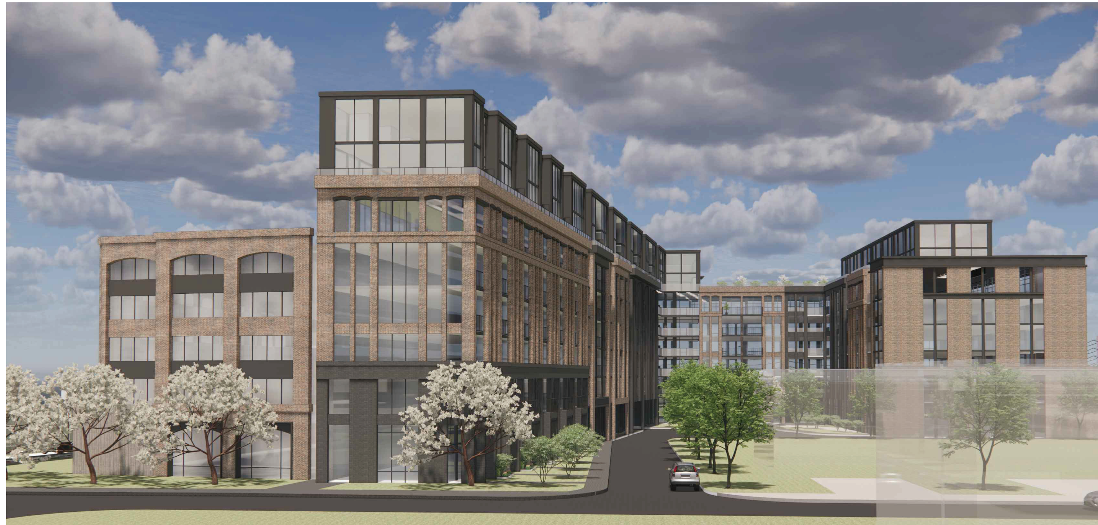
INTERIOR COURTYARD 1 A404