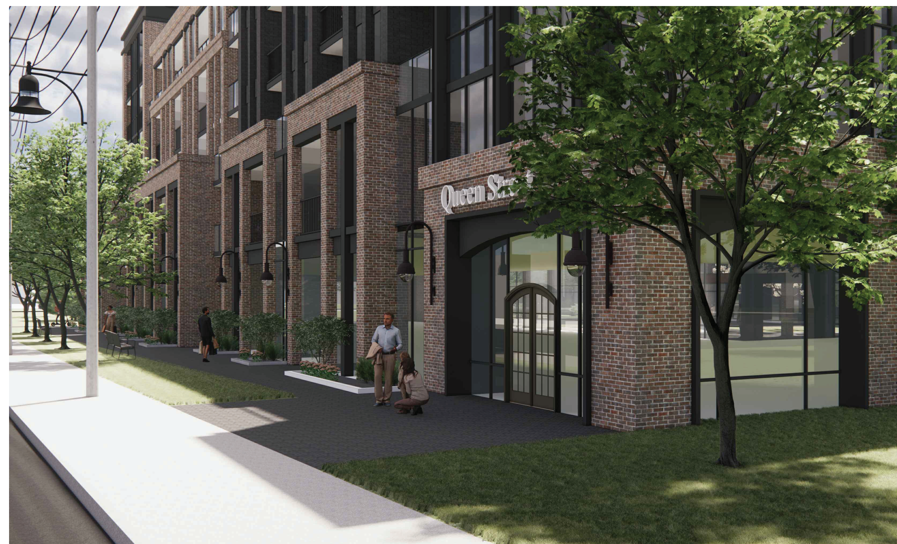
VIEW OF QUEEN STREET RESIDENTIAL ENTRY 4 A405

THIS DRAWING, AS AN INSTRUMENT OF SERVICE, IS PROVIDED BY AND IS THE PROPERTY OF GRAZIANI-CORAZZA ARCHITECTS INC. THE CONTRACTOR MUST VERIFY AND ACCEPT RESPONSIBILITY FOR ALL DIMENSIONS AND CONDITIONS ON SITE AND MUST NOTIFY GRAZIANI-CORAZZA ARCHITECTS INC. OF ANY VARIATIONS FROM THE SUPPLIED INFORMATION. GRAZIANI-CORAZZA ARCHITECTS INC. IS NOT RESPONSIBLE FOR THE ACCURACY OF SURVEY, STRUCTURAL, MECHANICAL, ELECTRICAL, AND OTHER ENGINEERING INFORMATION SHOWN ON THIS DRAWING. REFER TO THE APPROPRIATE ENGINEERING DRAWINGS BEFORE PROCEEDING WITH THE WORK. CONSTRUCTION MUST CONFORM TO ALL APPLICABLE CODES AND REQUIREMENTS OF THE AUTHORITIES HAVING JURISDICTION, UNLESS OTHERWISE NOTED. NO INVESTIGATION HAS BEEN UNDERTAKEN OR REPORTED ON BY THIS OFFICE IN REGARDS TO THE ENVIRONMENTAL CONDITION OF THIS SITE.