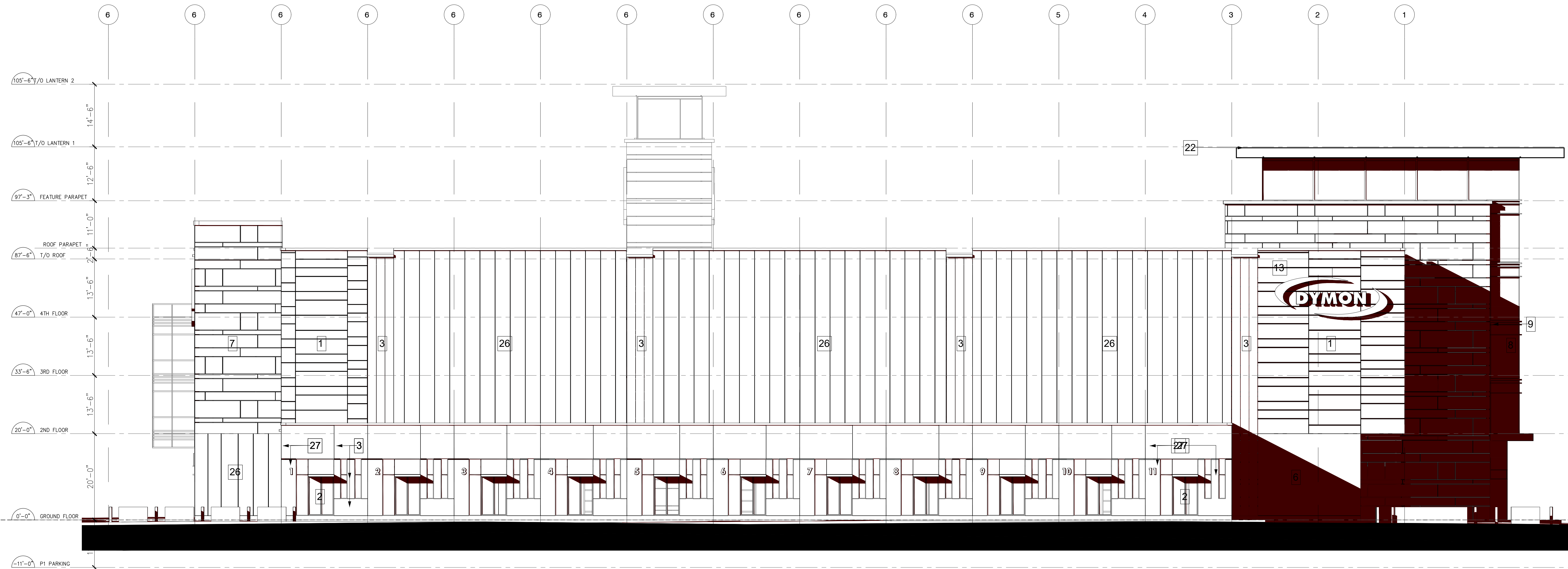
1 NORTH ELEVATION 3/32" = 1'-0"