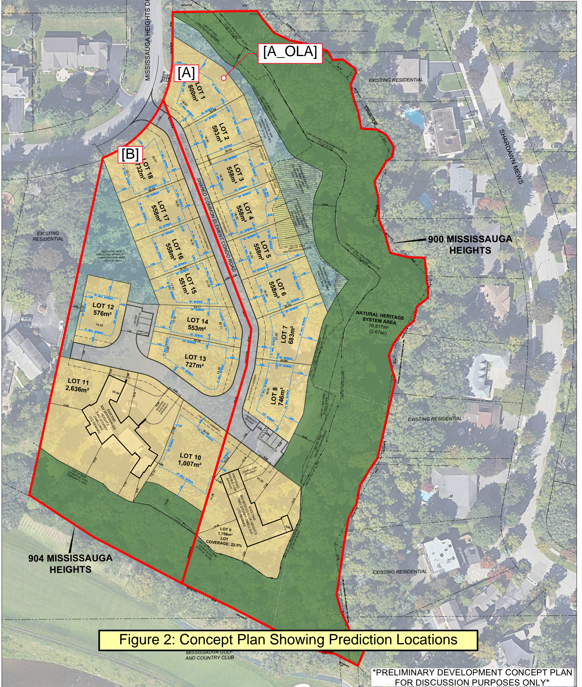
Figure 2: Concept Plan Showing Prediction Locations