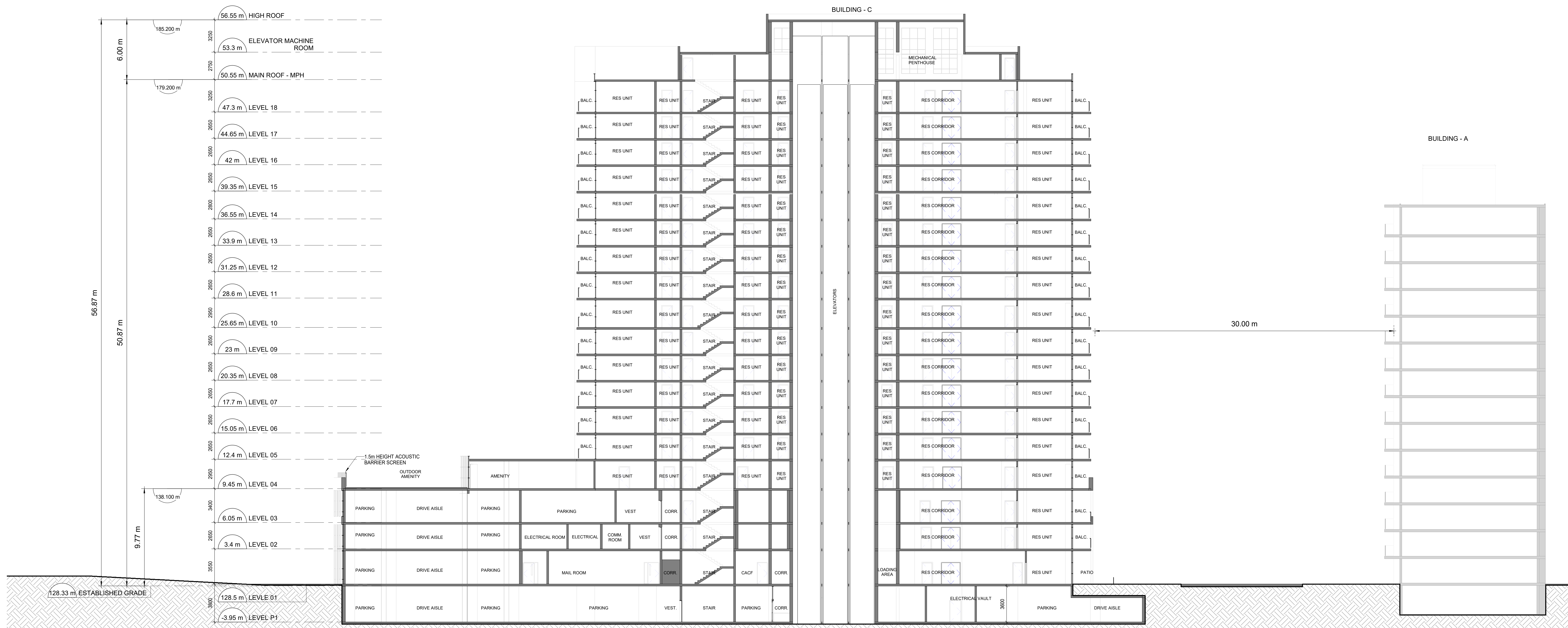
2 NORTH-SOUTH BUILDING - C SECTION A-302 / Scale: 1:150