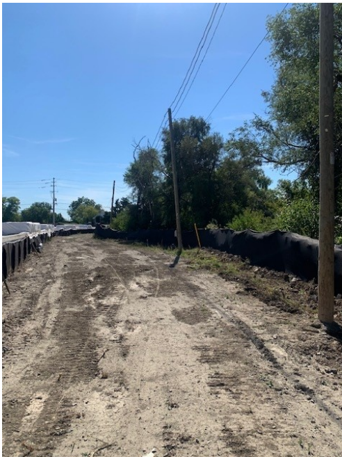
View South along South West limits (Phase 1 Lands)