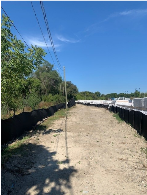
View NorthWest from South west corner (Phase 1 Lands)