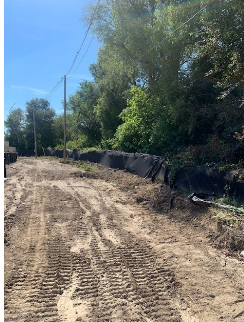
View South along south west limits (Phase 1 Lands)