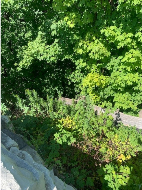
View at North West/West Corner (Phase 2 Lands)