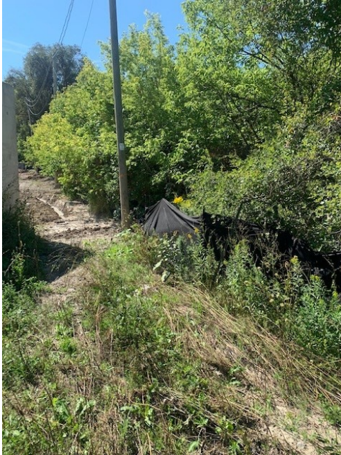
View South along south west limits (Phase 1 Lands)