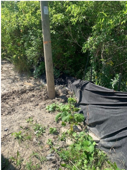
(Phase 1 Lands)