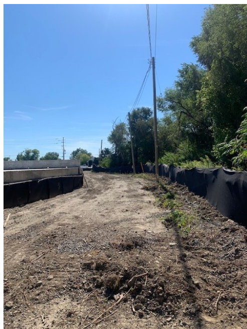
View South along South West limits (Phase 1 Lands)