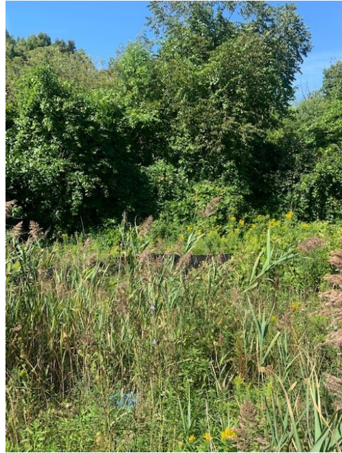
View South along South West limits at phase 2 development lands