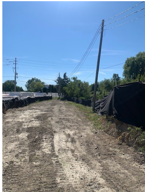
View South along South West limits (Phase 1 Lands)