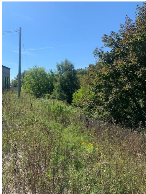
View South along South West limits at phase 2 development lands