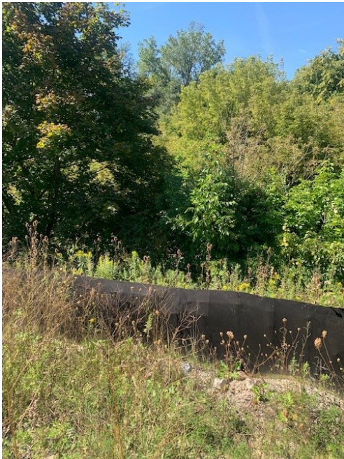
View South along South West limits at phase 2 development lands