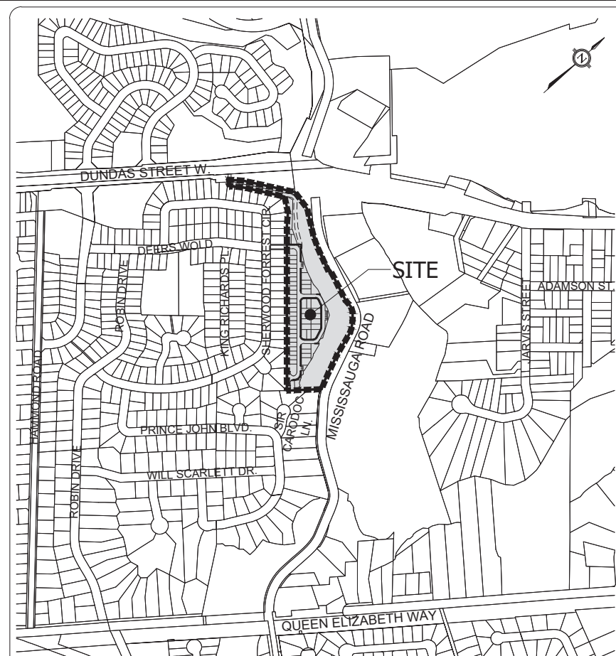
KEY PLAN 1:10,000