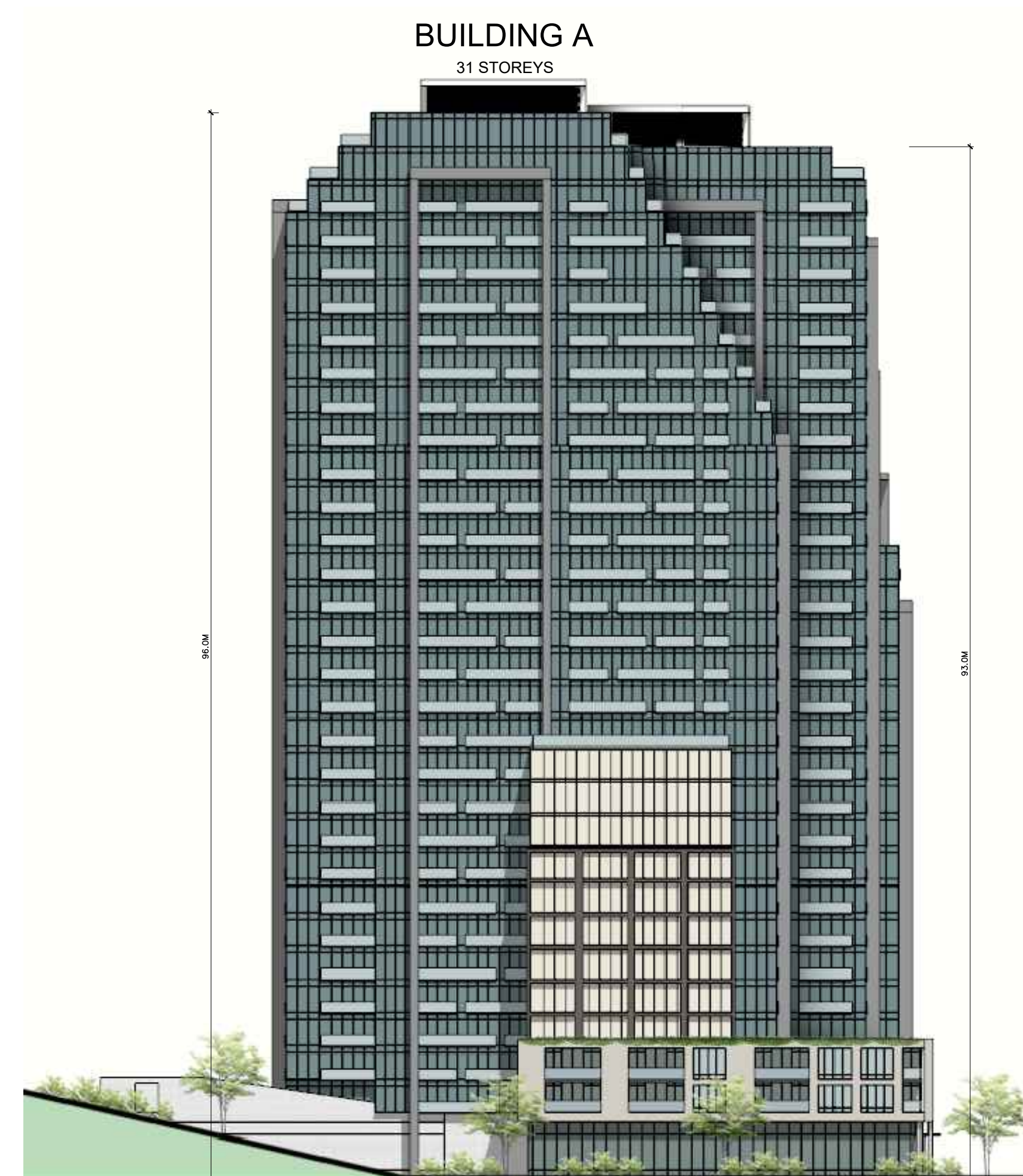
1 WEST ELEVATIONS Scale: 1:400