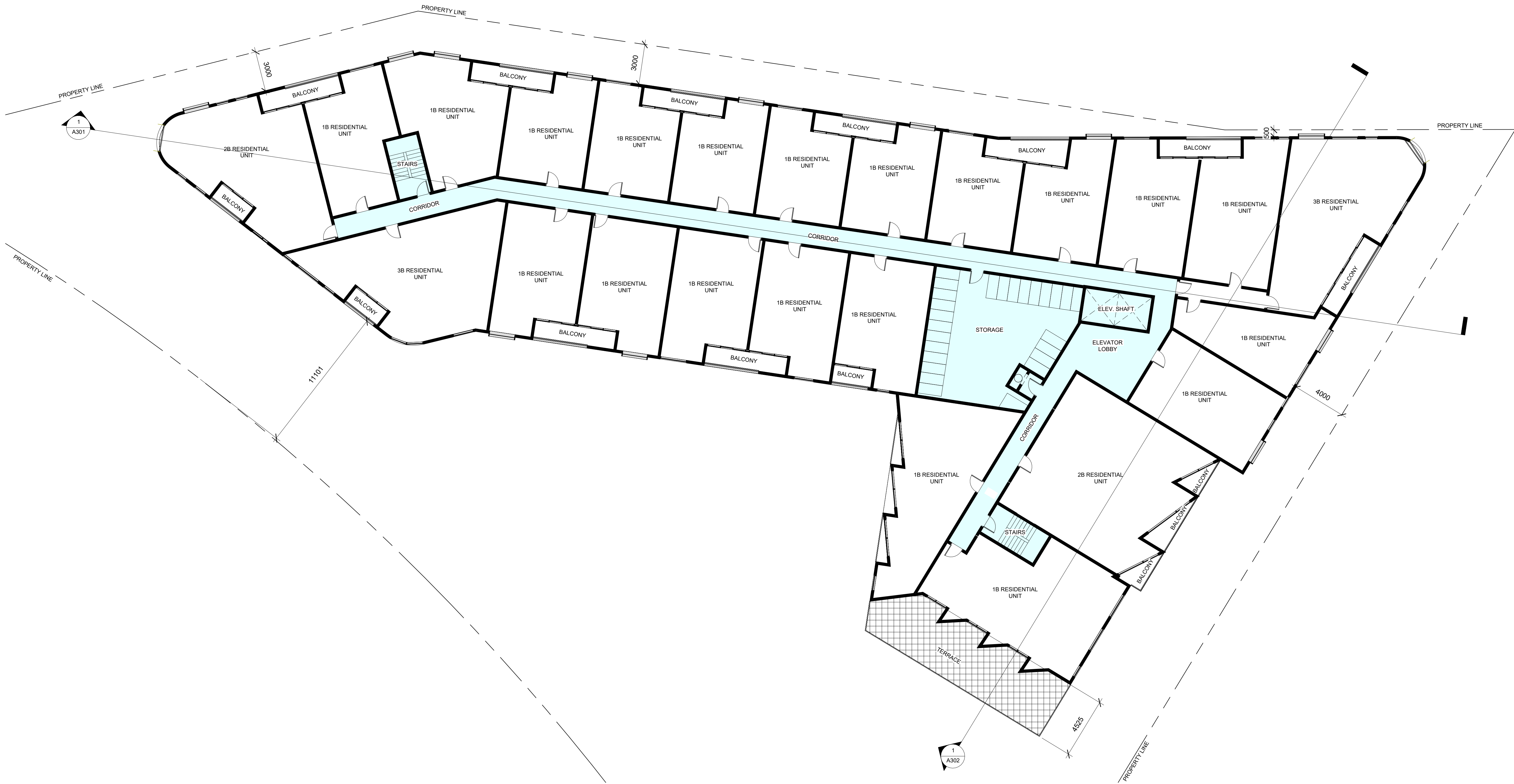
1 6th Level 1 : 150