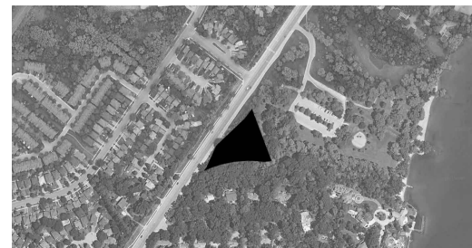
CONTEXT KEY PLAN