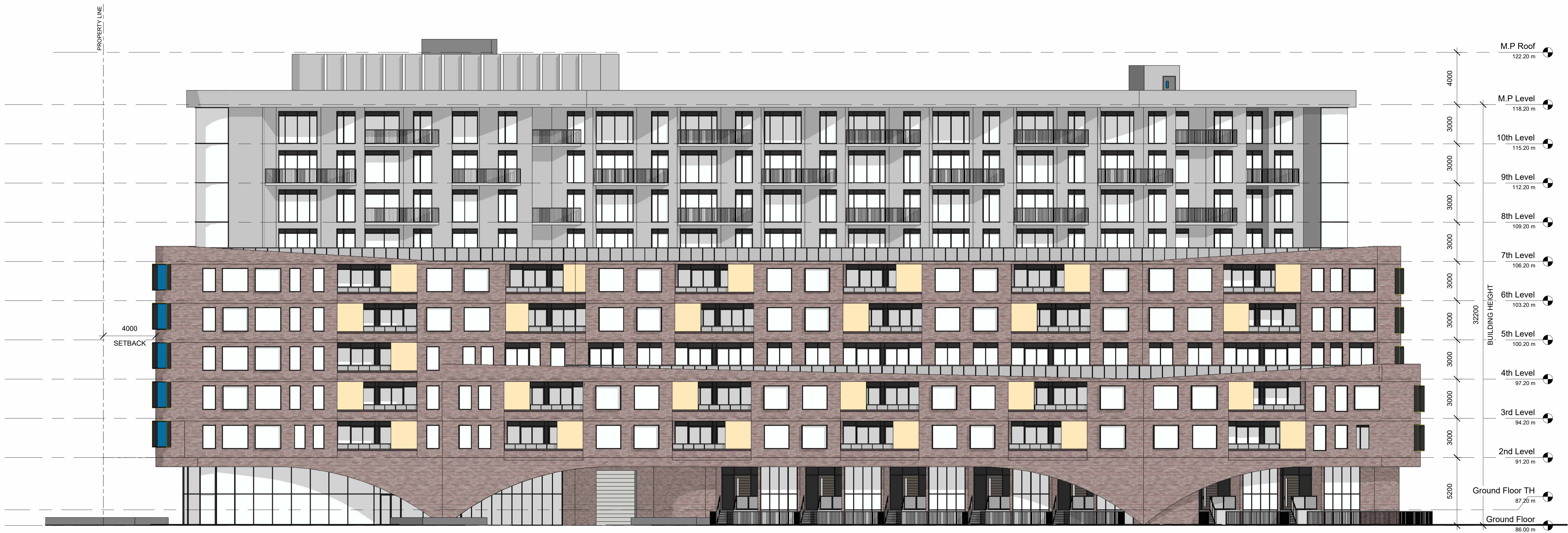
1 North Elevation 1 : 150