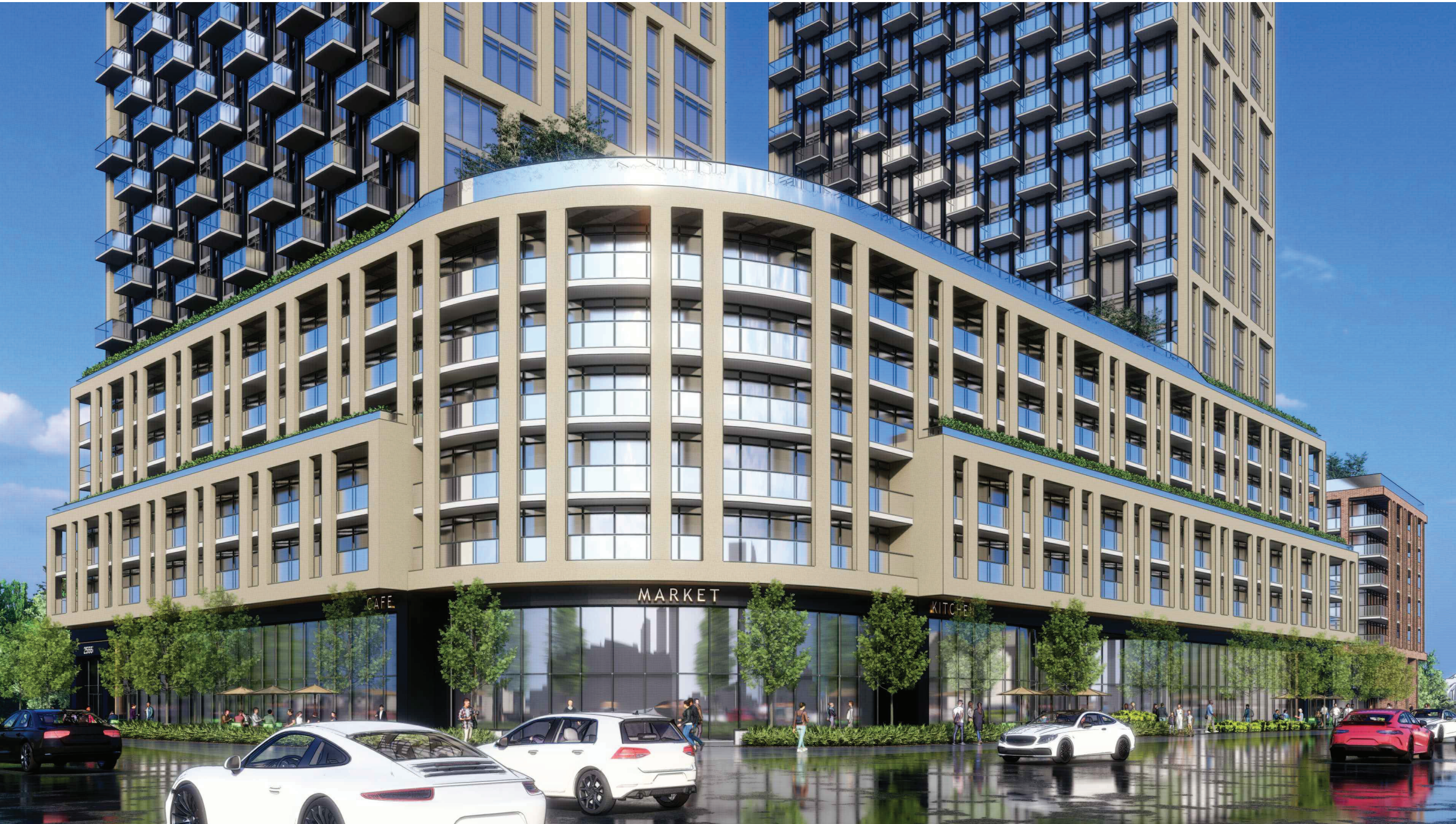
View from the corner of Erin Mills Parkway and Erin Centre Boulevard.