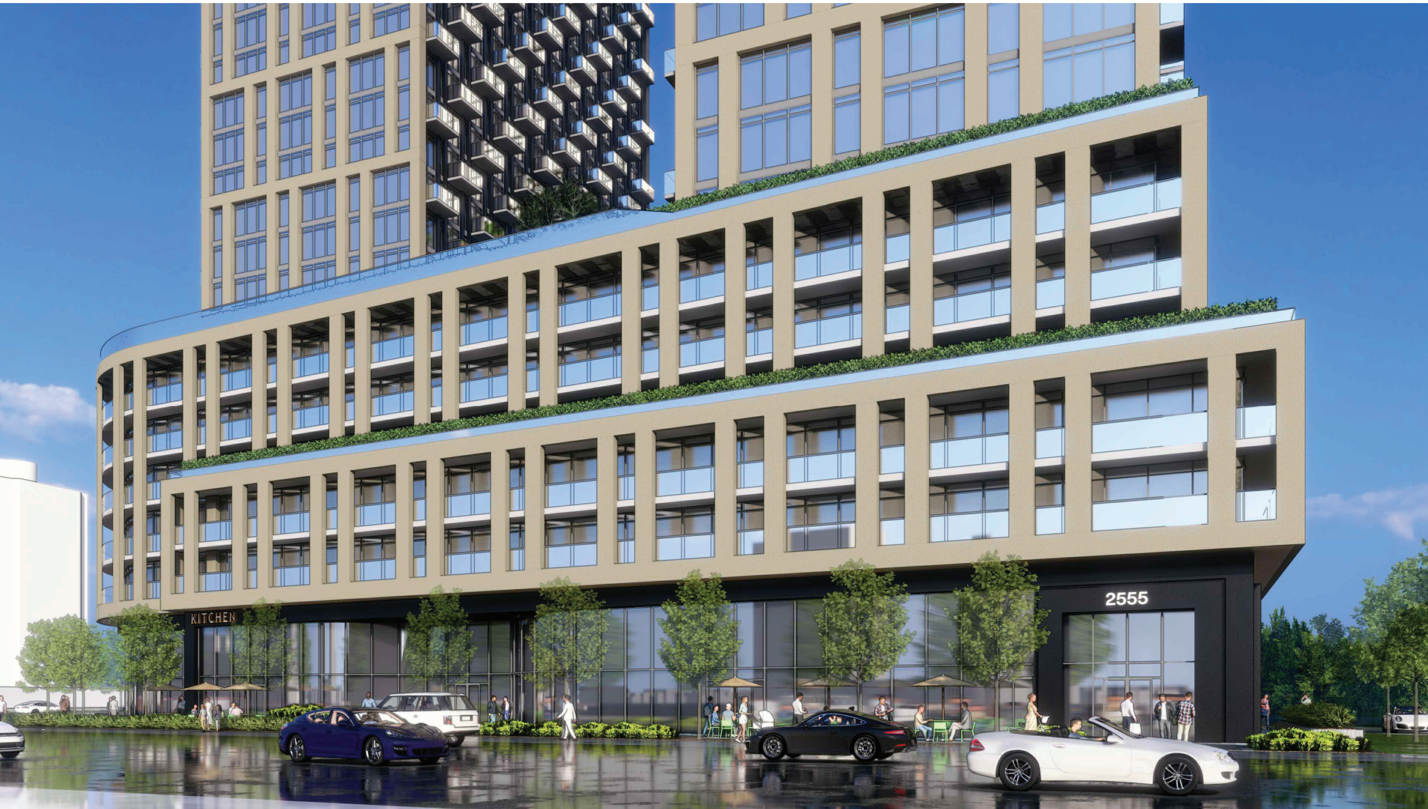
View from Erin Centre Boulevard.