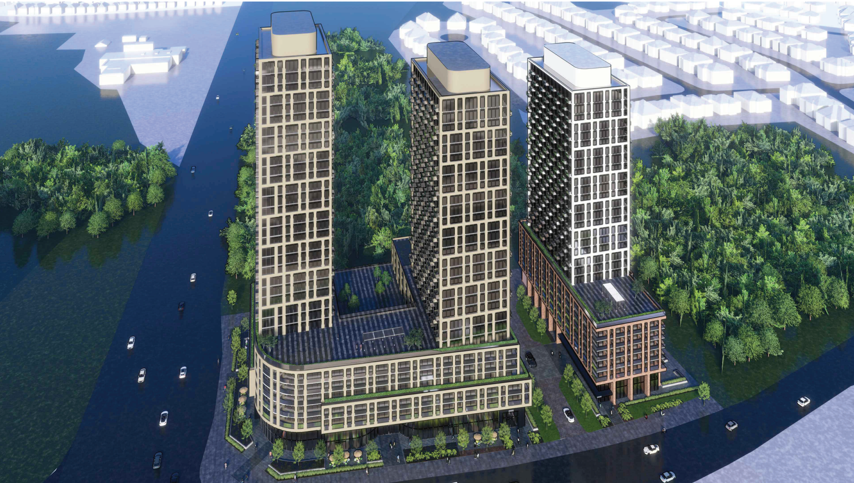
Respective view of the proposed development from Erin Mills Parkway and Erin Centre Boulevard.