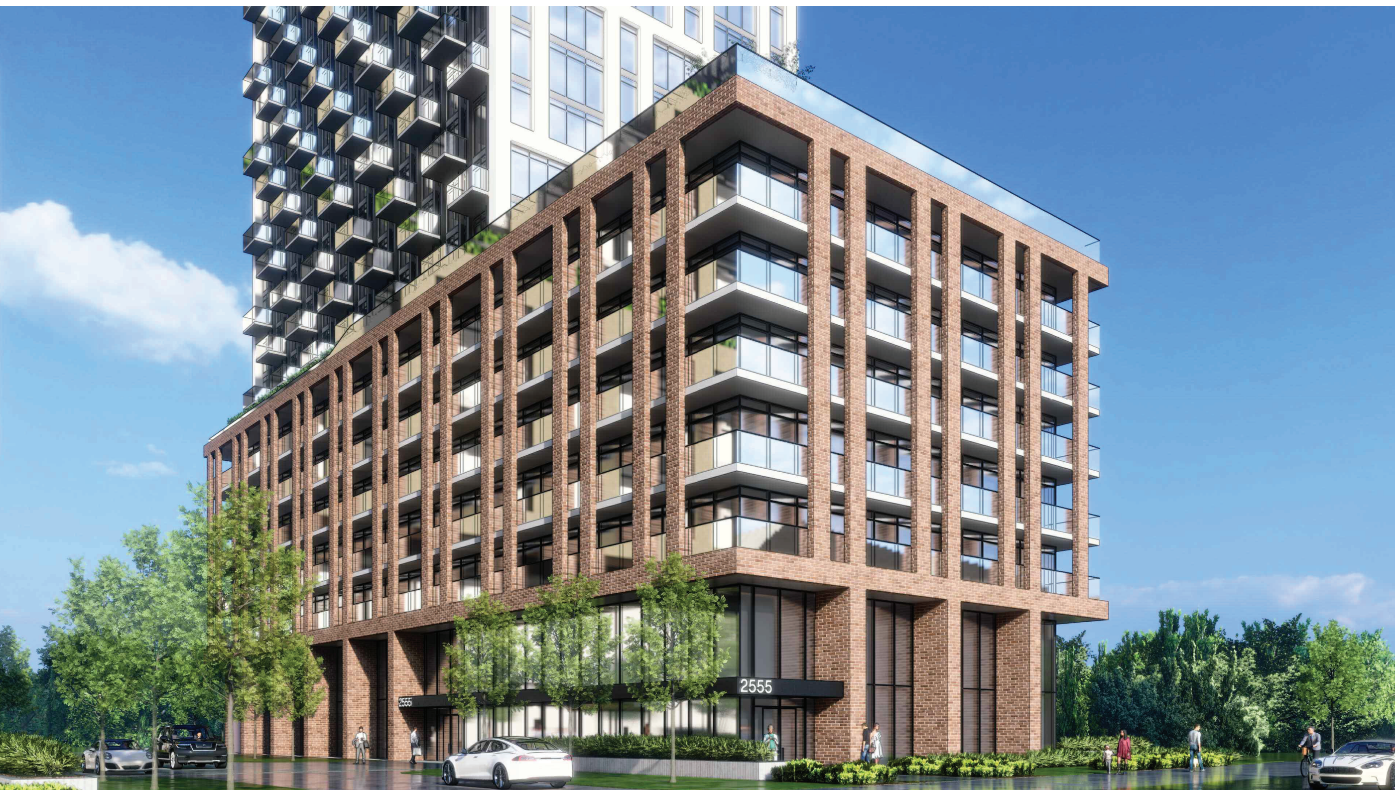
View from Erin Centre Boulevard - Drop off zone looking towards Erin Woods Park.