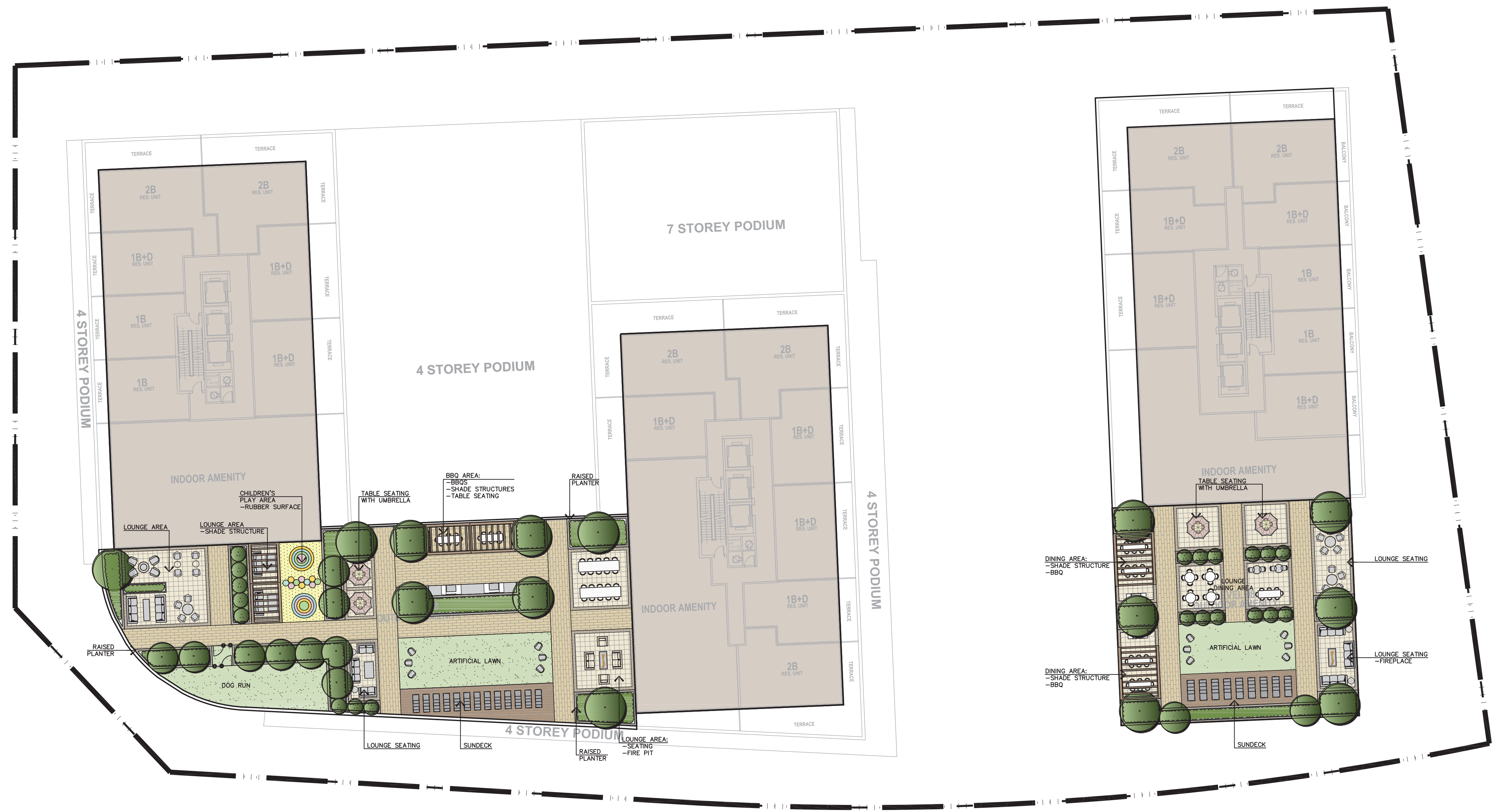
2 LEVEL 08 – ROOFTOP AMENITIES LANDSCAPE PLAN