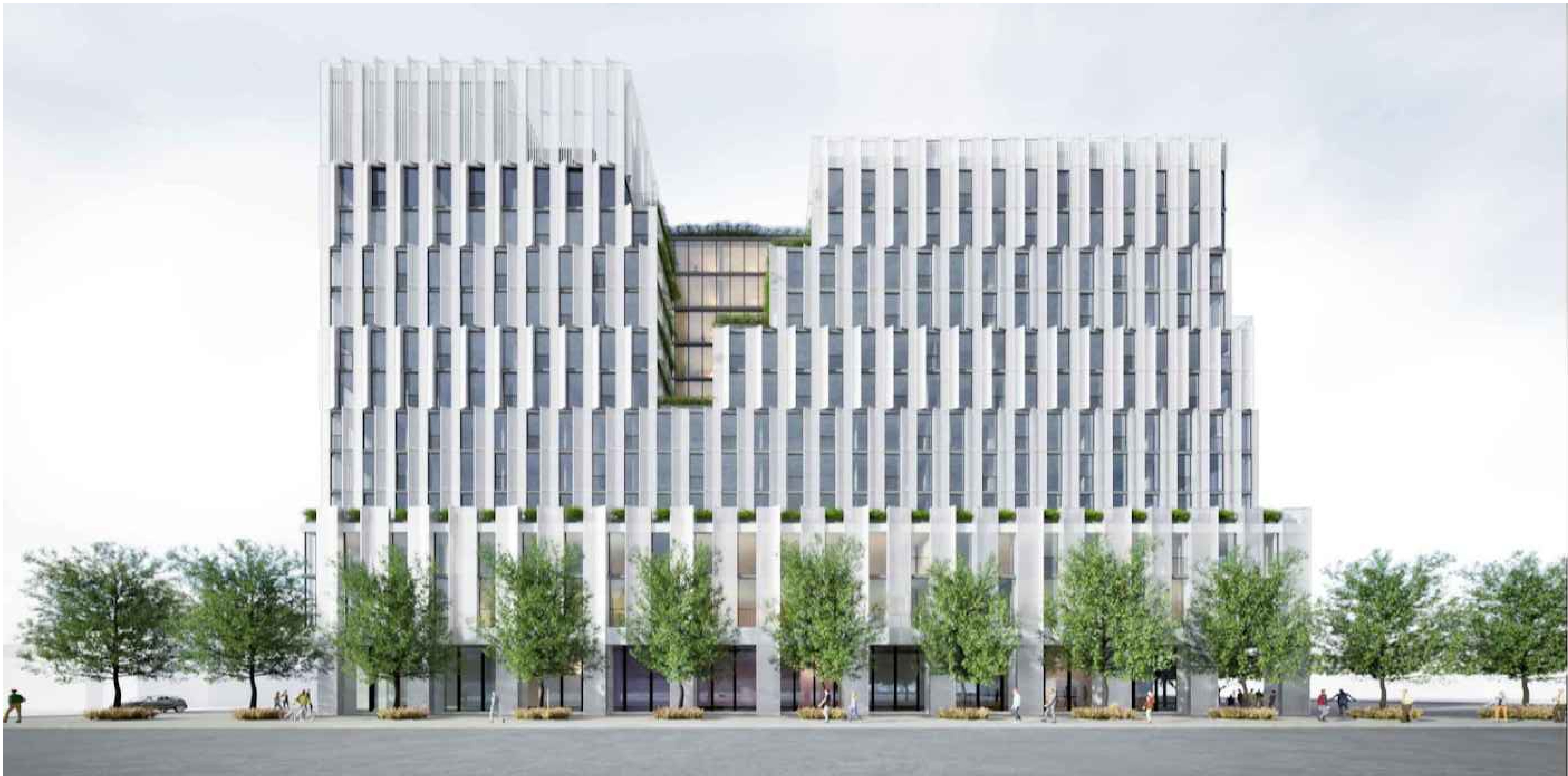
SOUTH ELEVATION VIEW FROM DUNDAS ST. W.

Note: This drawing is the property of the Architect and may not be reproduced or used without the expressed consent of the Architect. The Contractor is responsible for checking and verifying all levels and dimensions and shall report all discrepancies to the Architect and obtain clarification prior to commencing work.