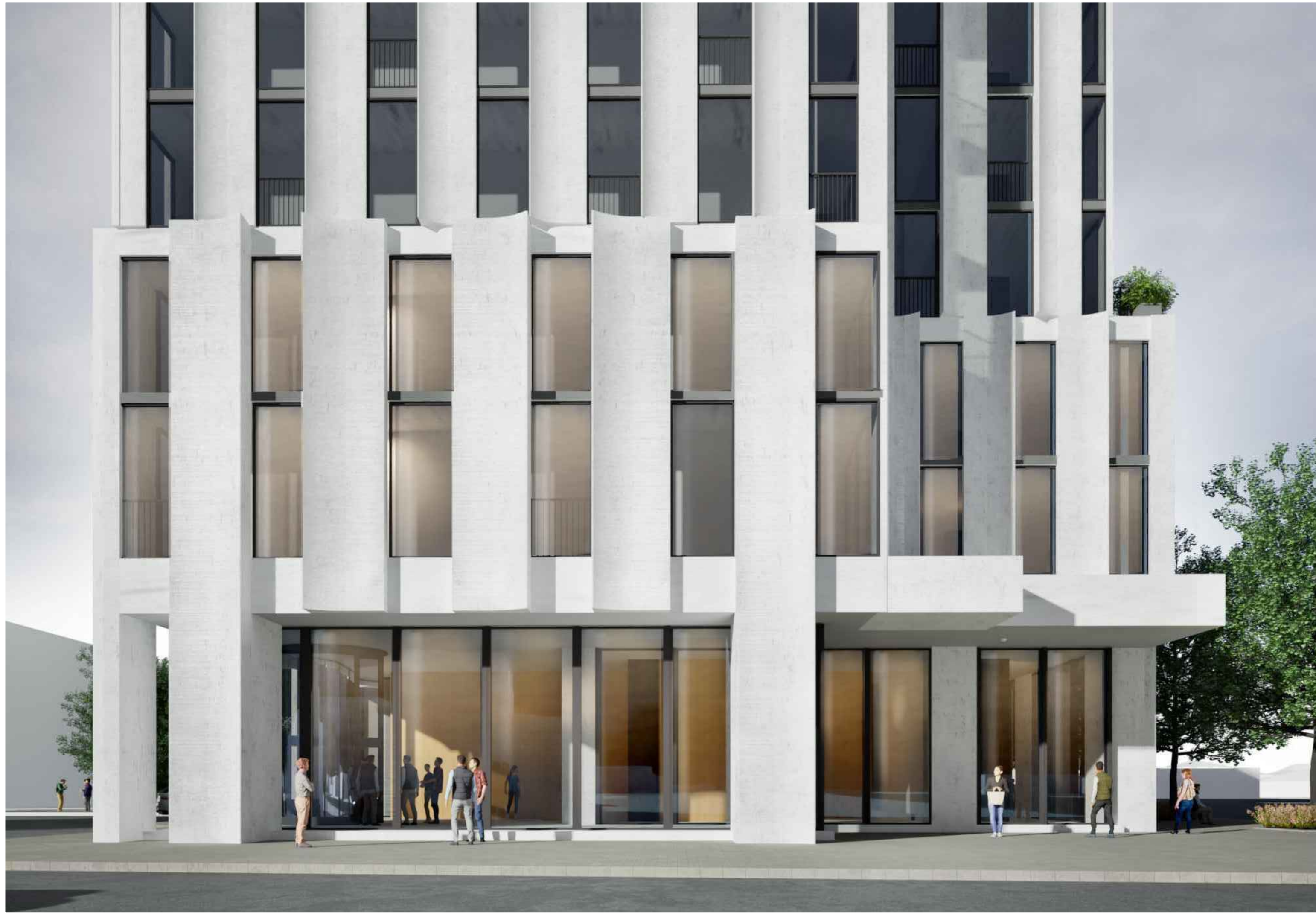
WEST ELEVATION AT MEDICAL CENTER AND NEW PUBLIC ROAD