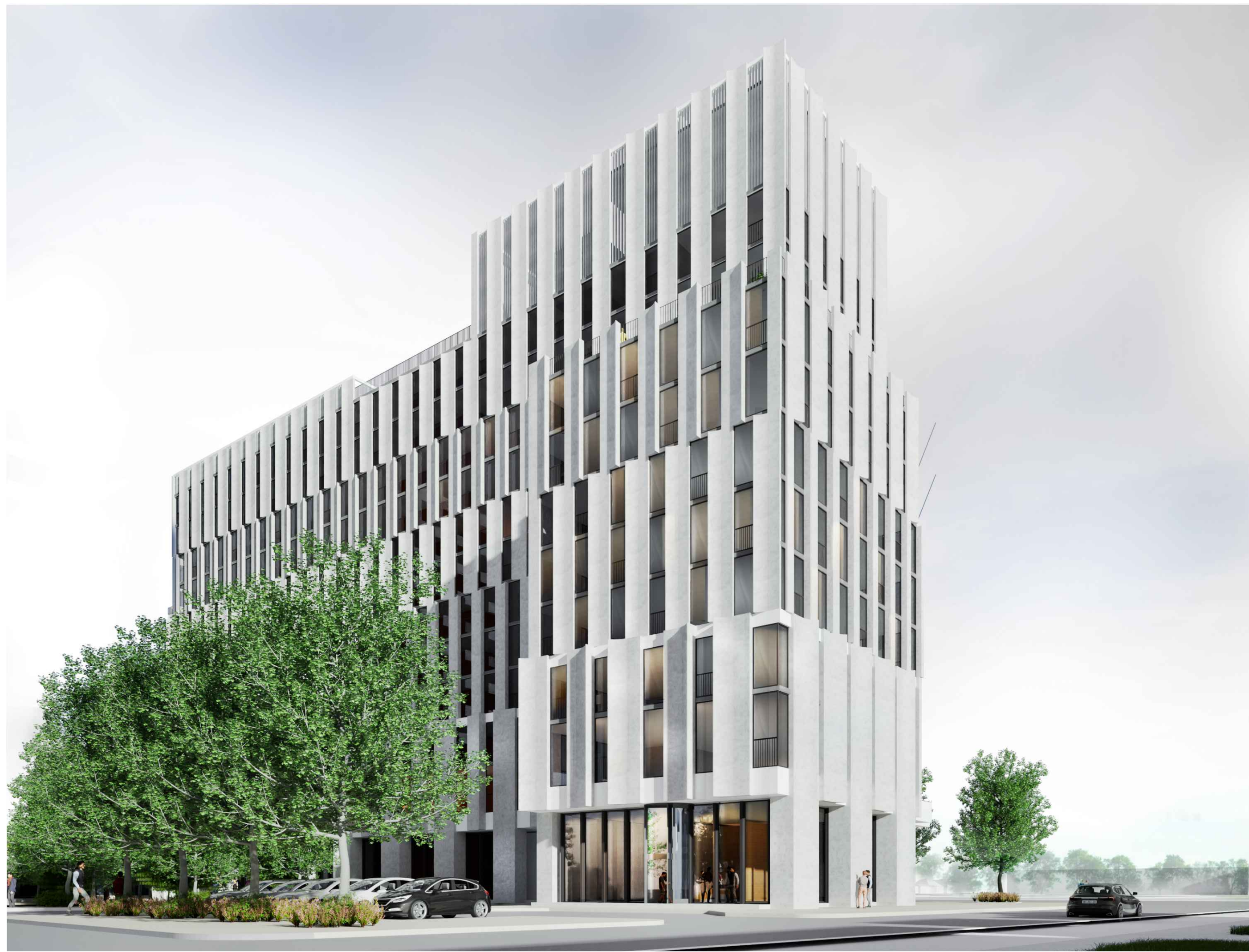
NORTH WEST CORNER OF BUILDING VIEW FROM NEW PUBLIC ROAD